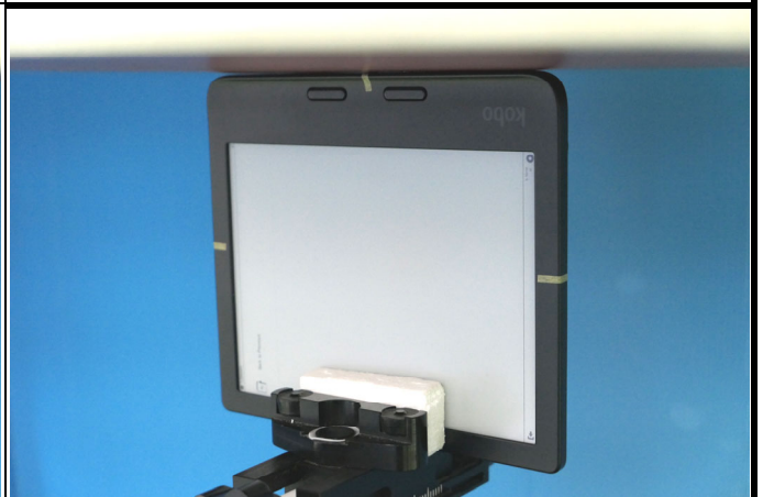
Bottom Side of EUT Tested