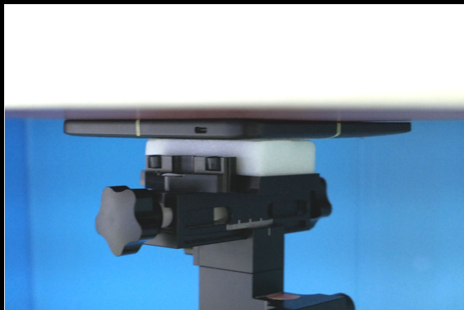
Front Side of EUT Tested