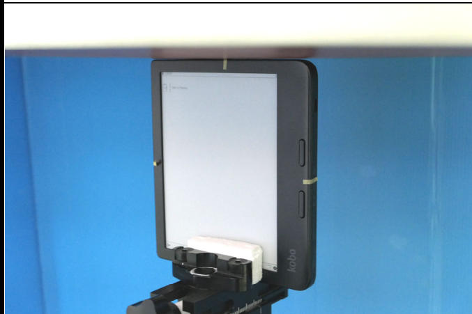
Right Side of EUT Tested