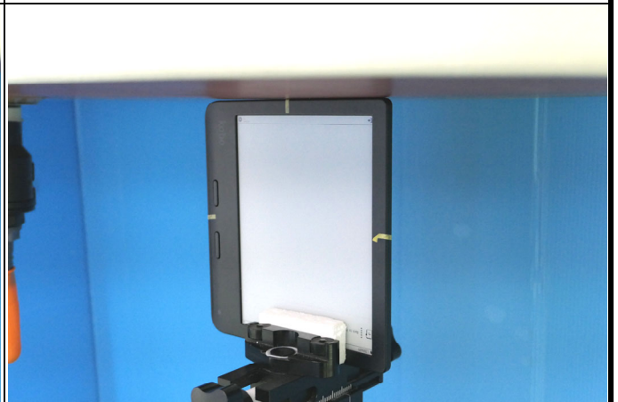
Left Side of EUT Tested