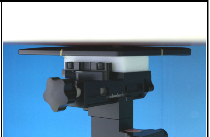
Back Side of EUT Tested