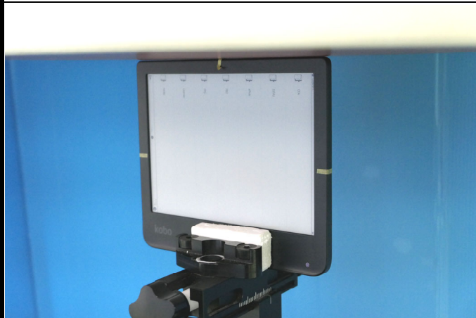
Top Side of EUT Tested