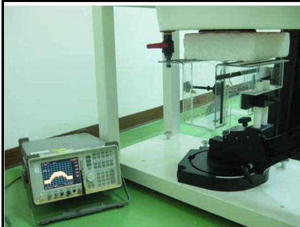
TEST SET UP PHOTO

NOTE: The EUT face to the phantom with 0mm-separation distance.