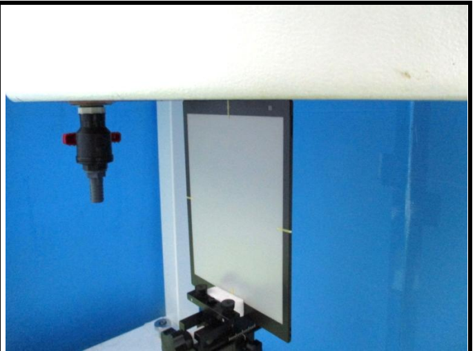
Body - Top Side of EUT at 0 mm