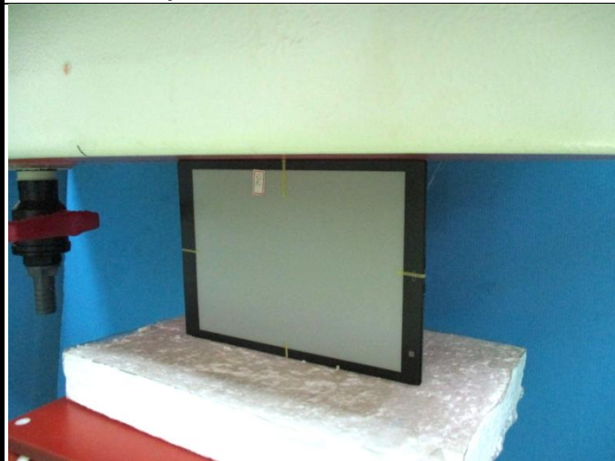
Body - Left Side of EUT at 0 mm