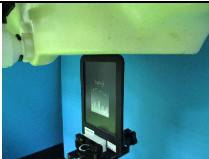
Top Side of EUT with 0 mm Gap