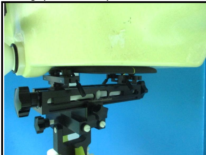
Rear Face of EUT with 0 mm Gap