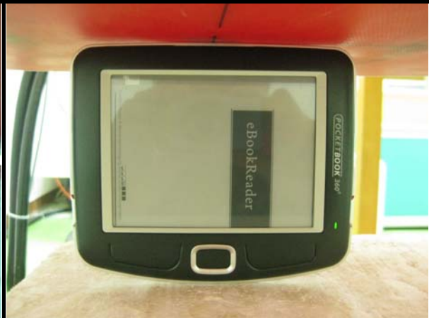
The edge of the EUT face to the phantom with 0mm-separation distance.