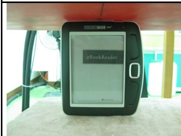
The Tip of the EUT face to the phantom with 0mm-separation distance.