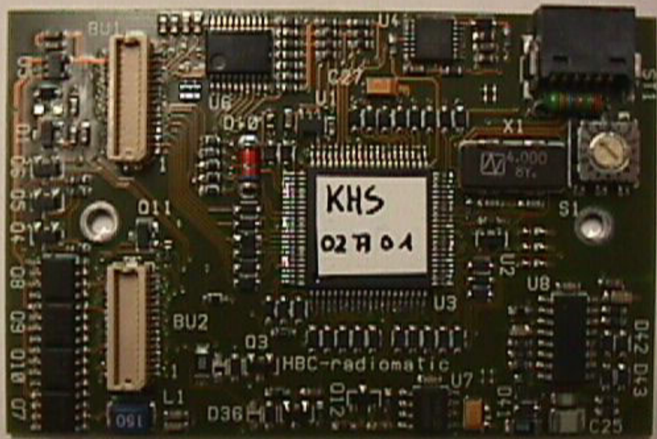
HBC Tx 716 Daughter PCB