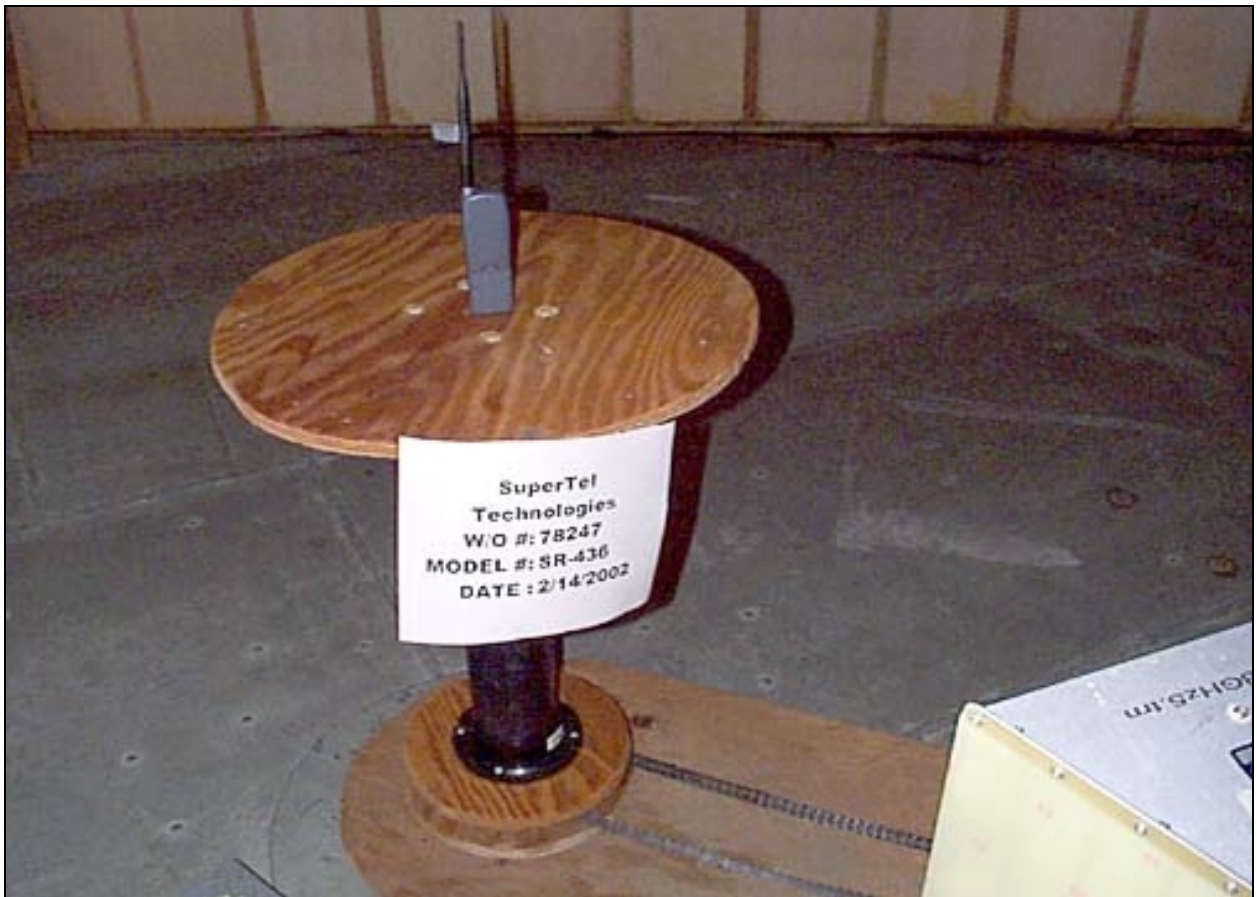
Radiated Emissions - Back View - SR-436 Handset Vertical