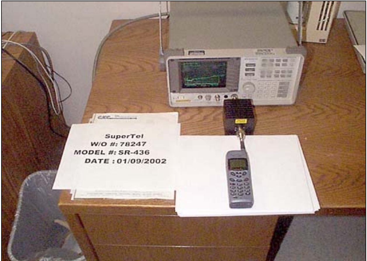
PHOTOGRAPH SHOWING ANTENNA CONDUCTED EMISSIONS - HANDSET