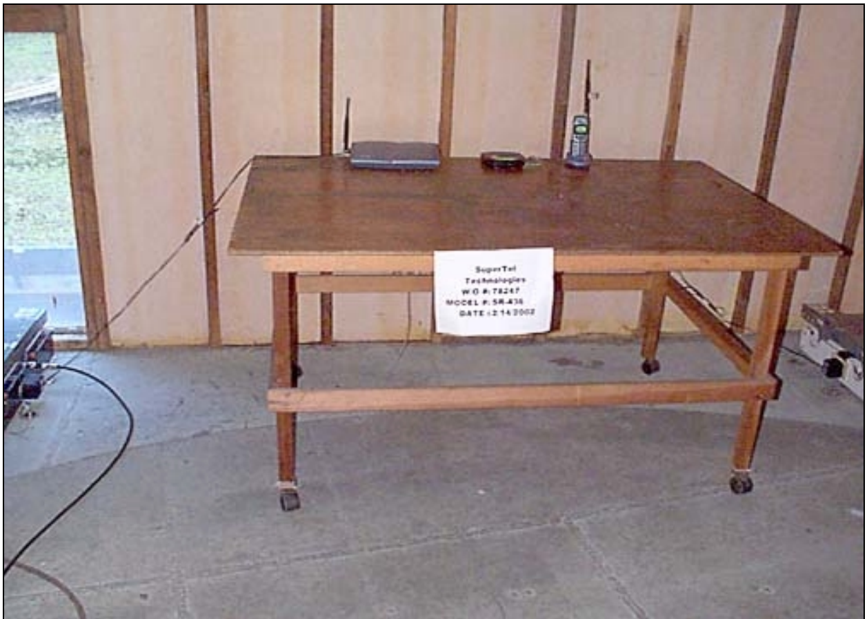
Mains Conducted Emissions - Front View - SR-436