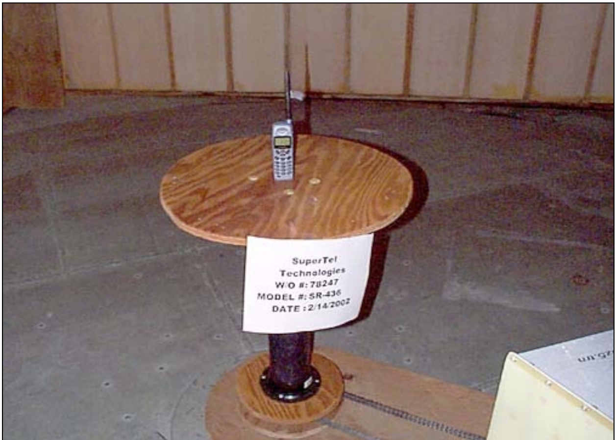
Radiated Emissions - Front View - SR-436 Handset Vertical