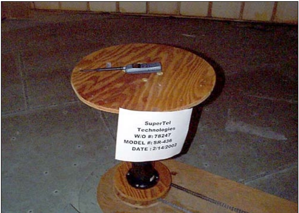
Radiated Emissions - Front View - SR-436 Handset Horizontal