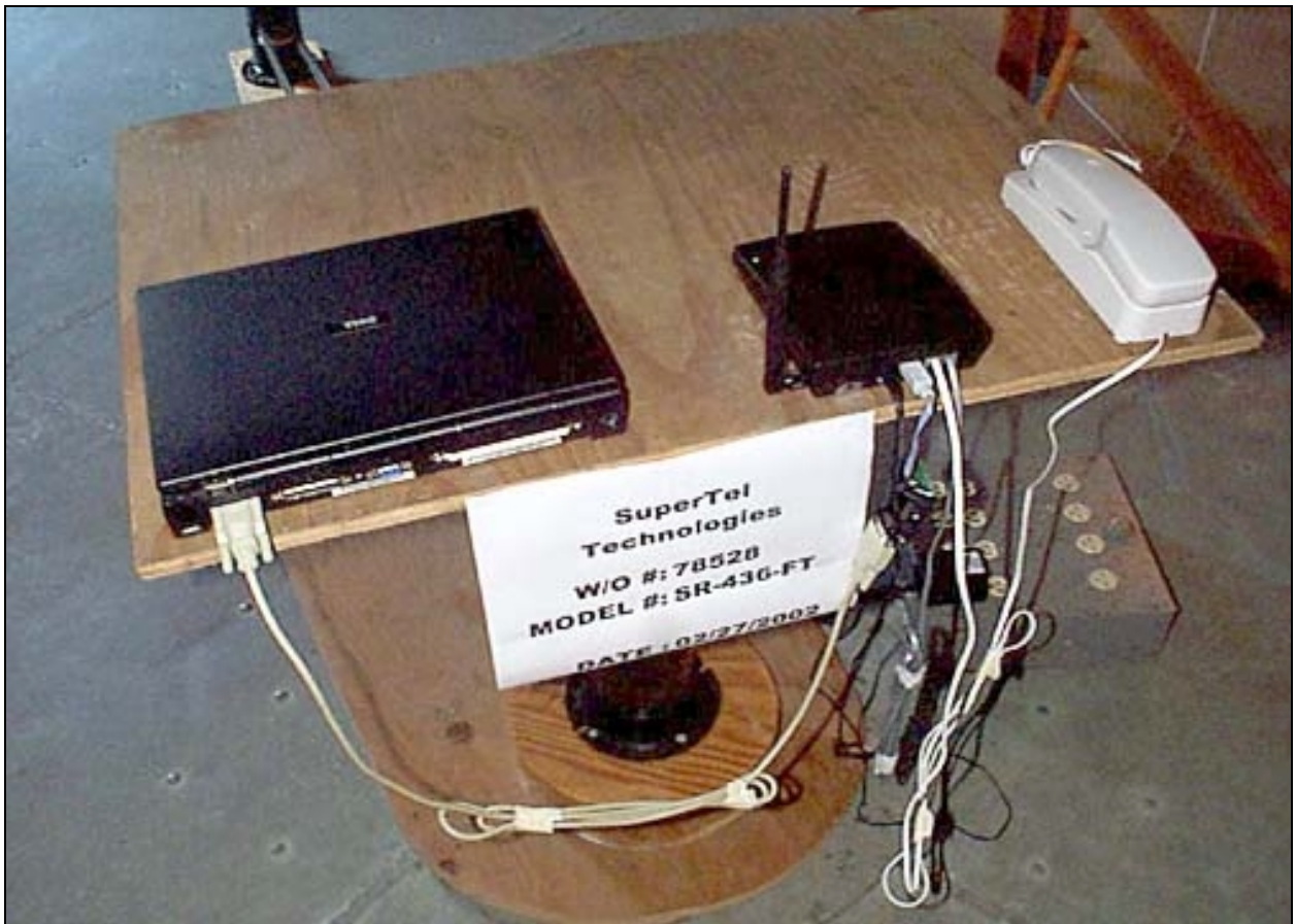
Radiated Emissions - Back View - SR-436-FT