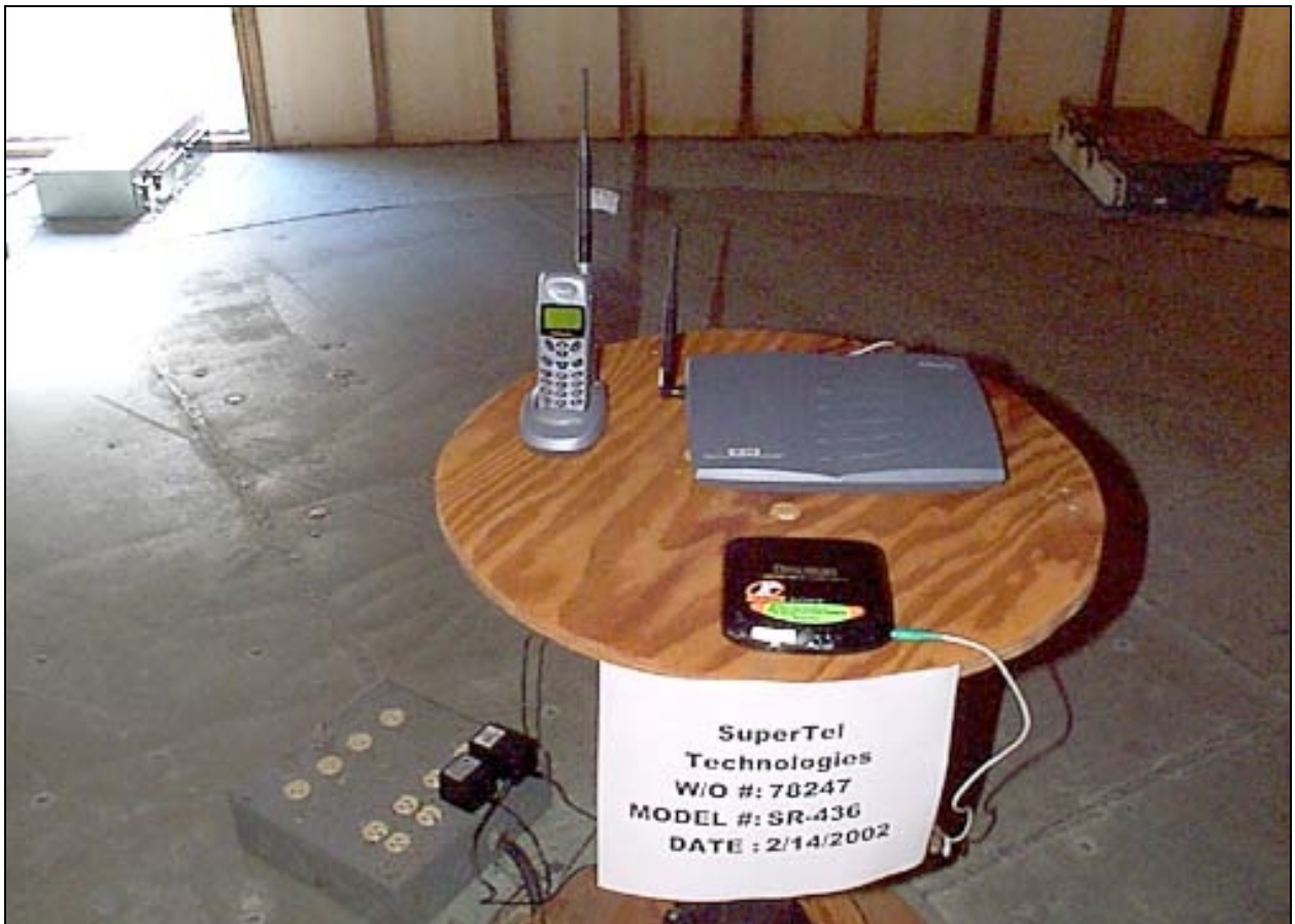
Radiated Emissions - Front View - SR-436 Base and Charger