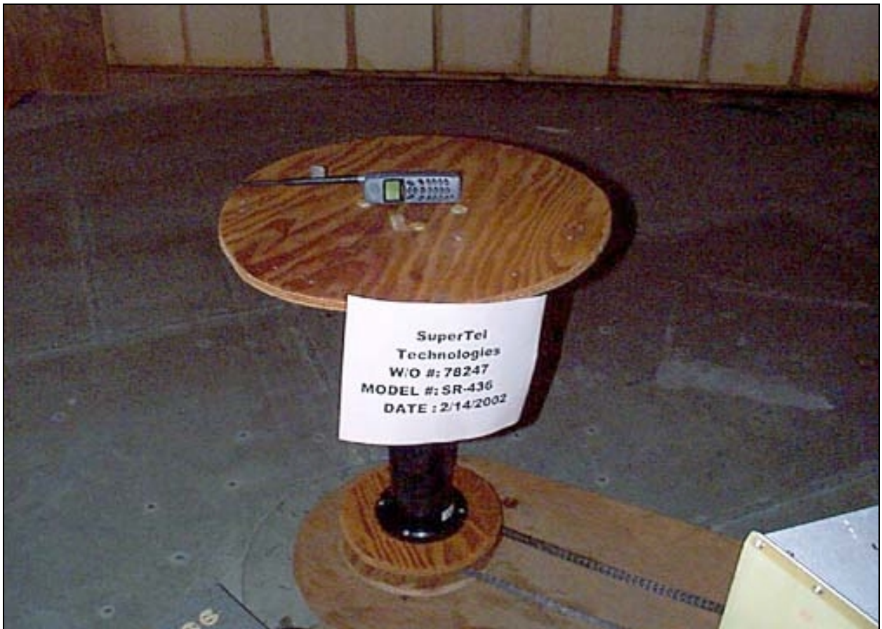
Radiated Emissions - Back View - SR-436 Handset Side