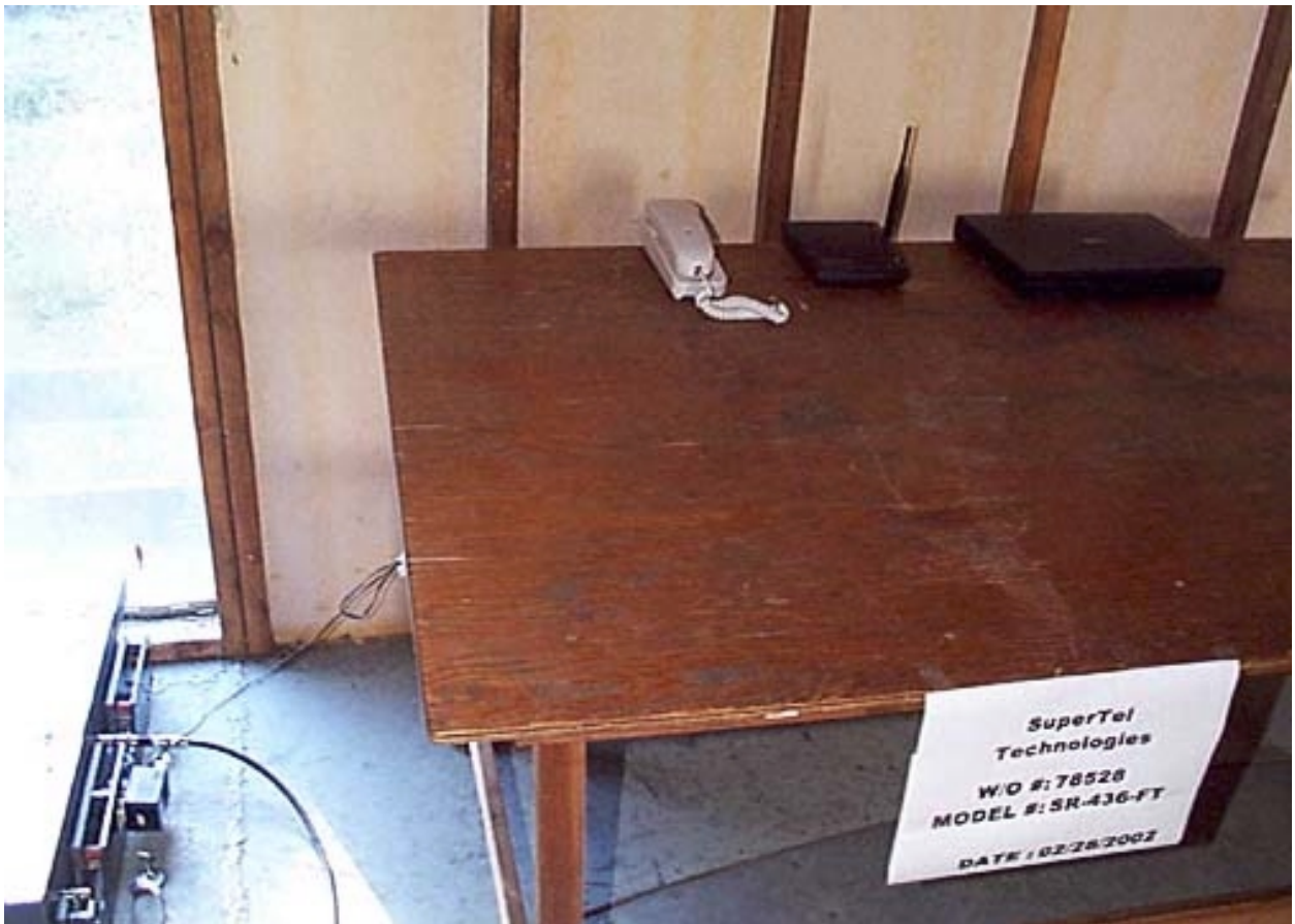
Mains Conducted Emissions - Front View - SR-436-FT