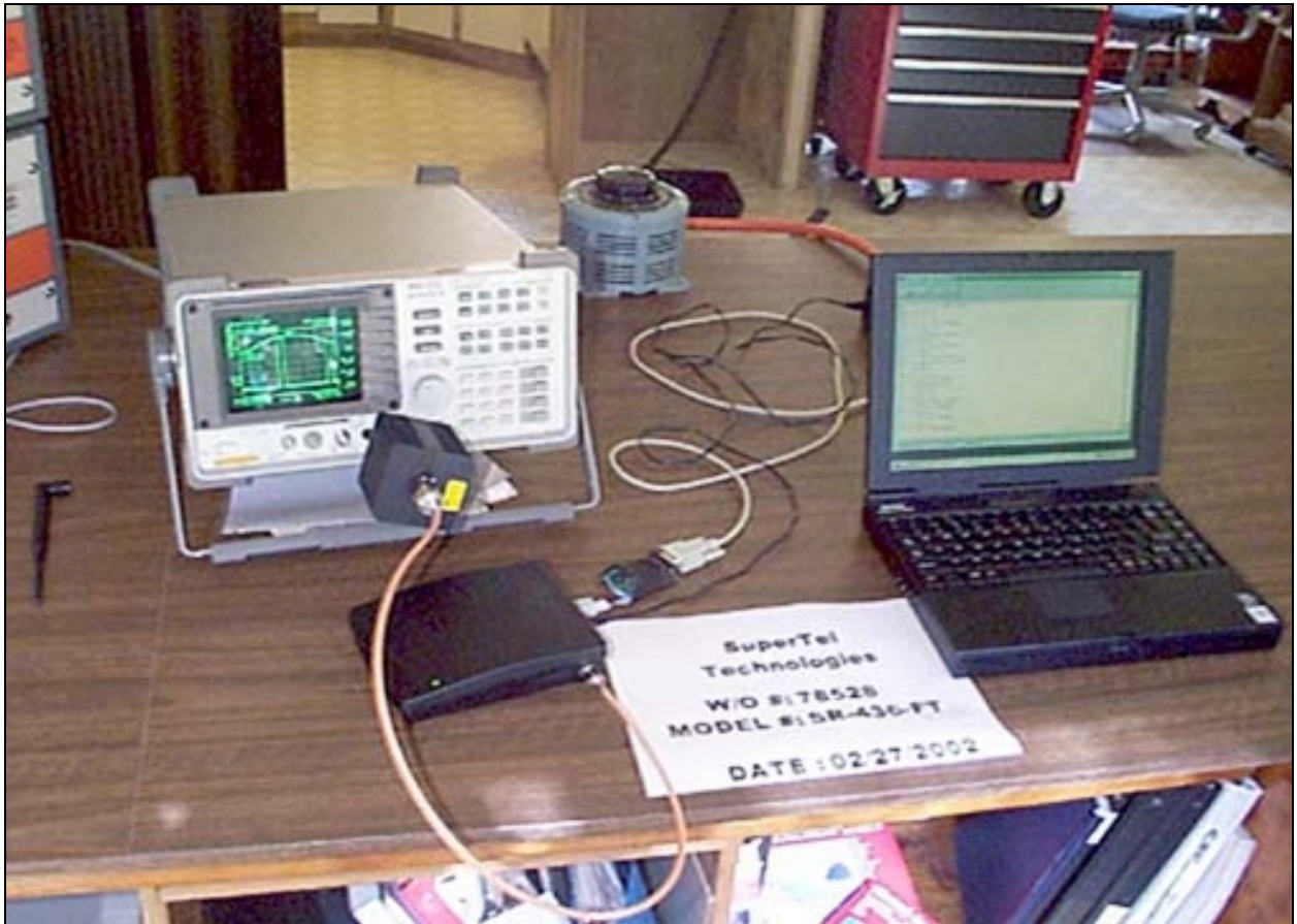
Voltage Variation - Front View - SR-436-FT