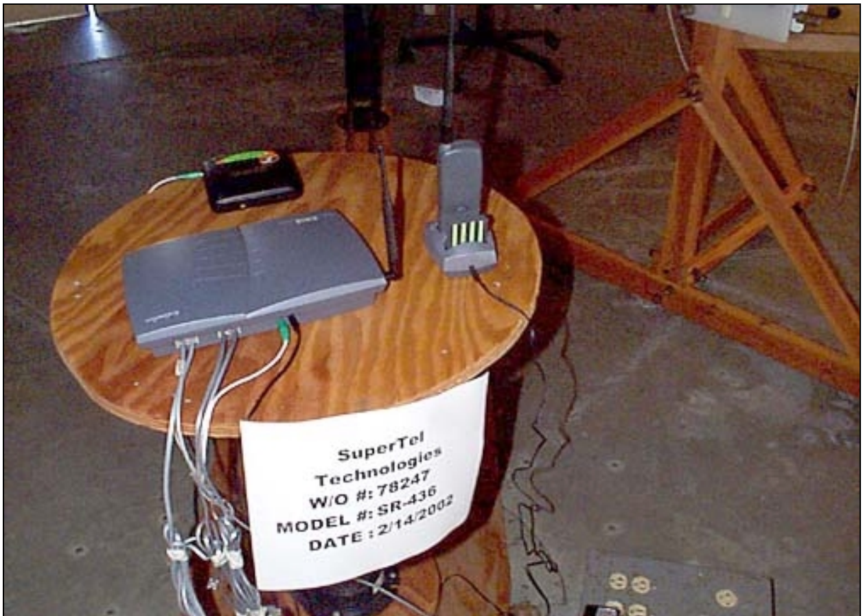
Radiated Emissions - Back View - SR-436 Base and Charger