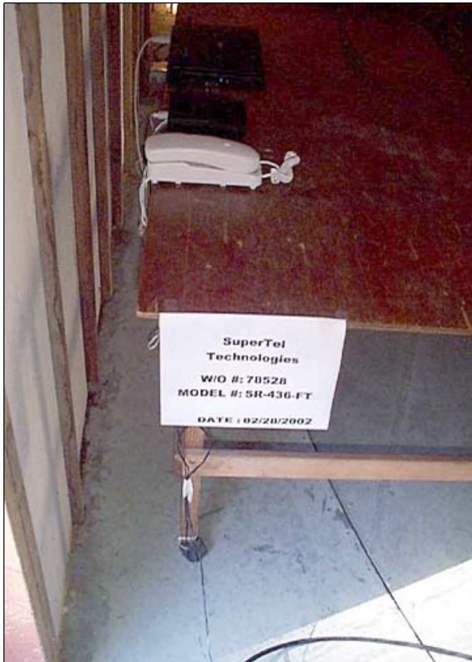
Mains Conducted Emissions - Side View - SR-436-FT