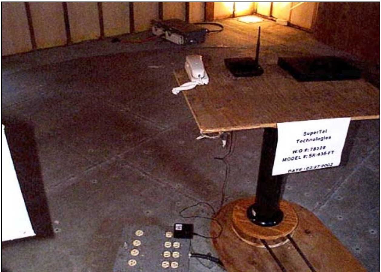
Radiated Emissions - Front View - SR-436-FT