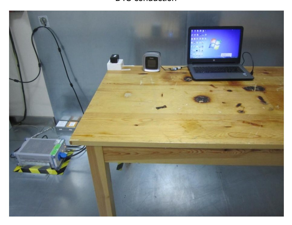
DTS radiation L