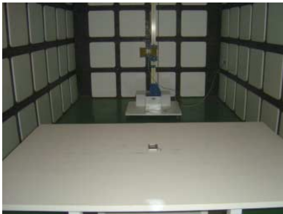
6.2.Photo of Band Edges Measurement