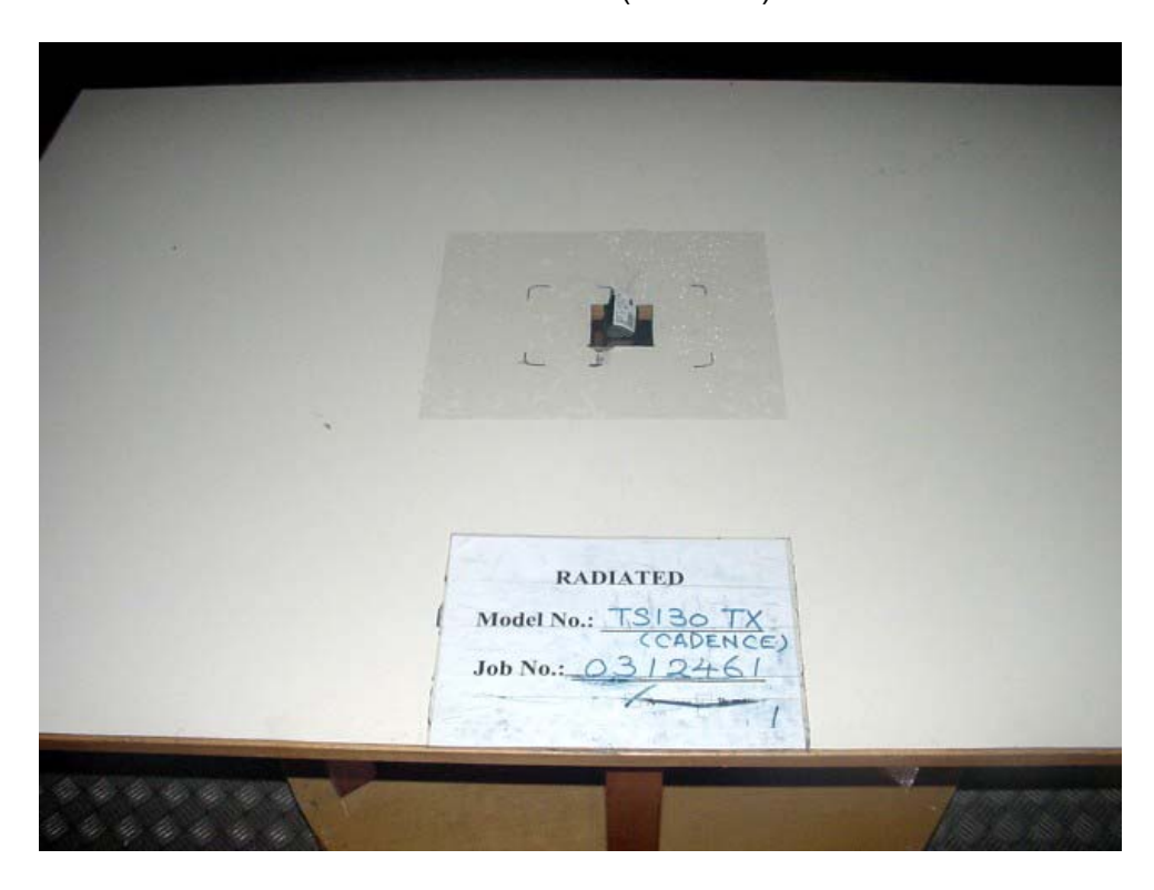
Radiated – rear (cadence)