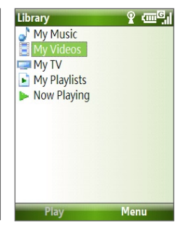
Library screen The screen that lets you quickly find your audio files, video files, and playlists.

Click Menu to open a list of options that you can do in a particular screen The commands on this menu vary, depending upon which screen you are viewina.