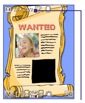
Displays the current and total number of photos that can be taken using the selected template.