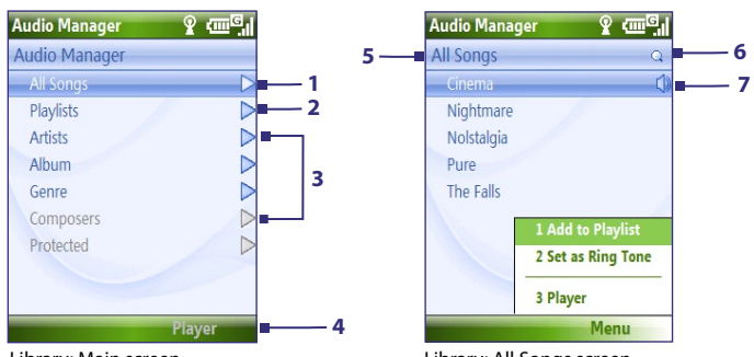
Library: Main screen

On the Audio Manager's Library screen, an arrow that appears in an item indicates that there is a submenu available. Use the NAVIGATION CONTROL to go through the items and press CENTER OK to open the submenu.