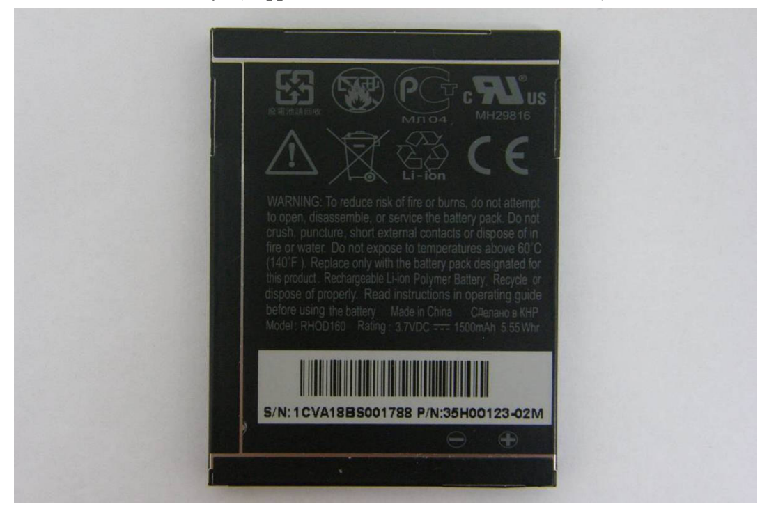
Battery 2(Supplier: WELLDONE, Model:SAPP160)

Unless otherwise stated the results shown in this test report refer only to the sample(s) tested and such sample(s) are retained for 90 days only. This test report cannot be reproduced, except in full, without prior written permission of the Company. 除非另有說明,此報告結果僅對測試之樣品負責,同時此樣品僅保留90天。本報告未經本公司書面許可,不可部份複製。 This document is issued by the Company subject to its General Conditions of Service (<u>www.sgs.com/terms_and_conditions.htm</u>) and Terms and Conditions for Electronic Documents (<u>www.sgs.com/terms_e-document.htm</u>). Attention is drawn to the limitations of liability, indemnification and jurisdictional issues established therein. Even if printed this electronic document is to be treated as an original within the meaning of UCP 600 article 20b. The authenticity of this document may be verified at <u>www.sgs.ond/terms_end/authentication</u>. Any holder of this document is is to be treated as an original within the meaning of UCP 600 article 20b. The authenticity of this document may be verified at <u>www.sgs.ond/terms_end/authentication</u>. Any holder of this document is is intervention only and within the limits of client's instructions, if any. The Company's sindings at the time of its intervention only and within the limits of client's instructions, if any. The Company's sole responsibility is to its Client and this document does not exonerate parties to a transaction from exercising all their rights and obligations under the transaction documents.