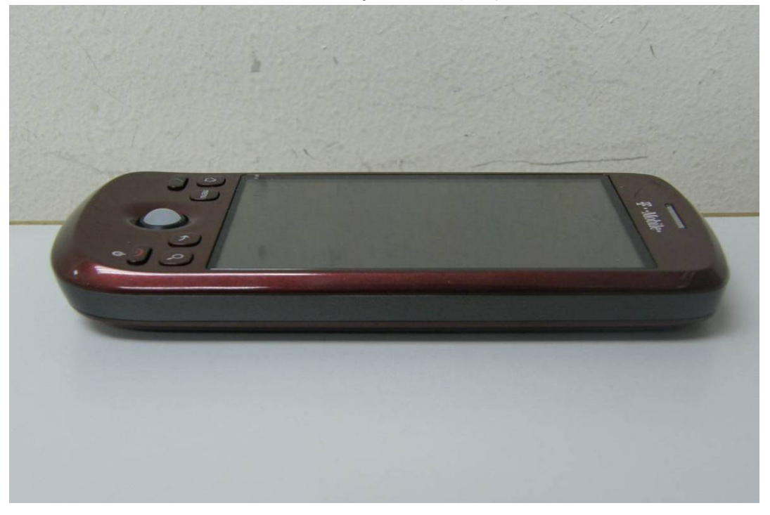
Side View of EUT – 3 (Red)