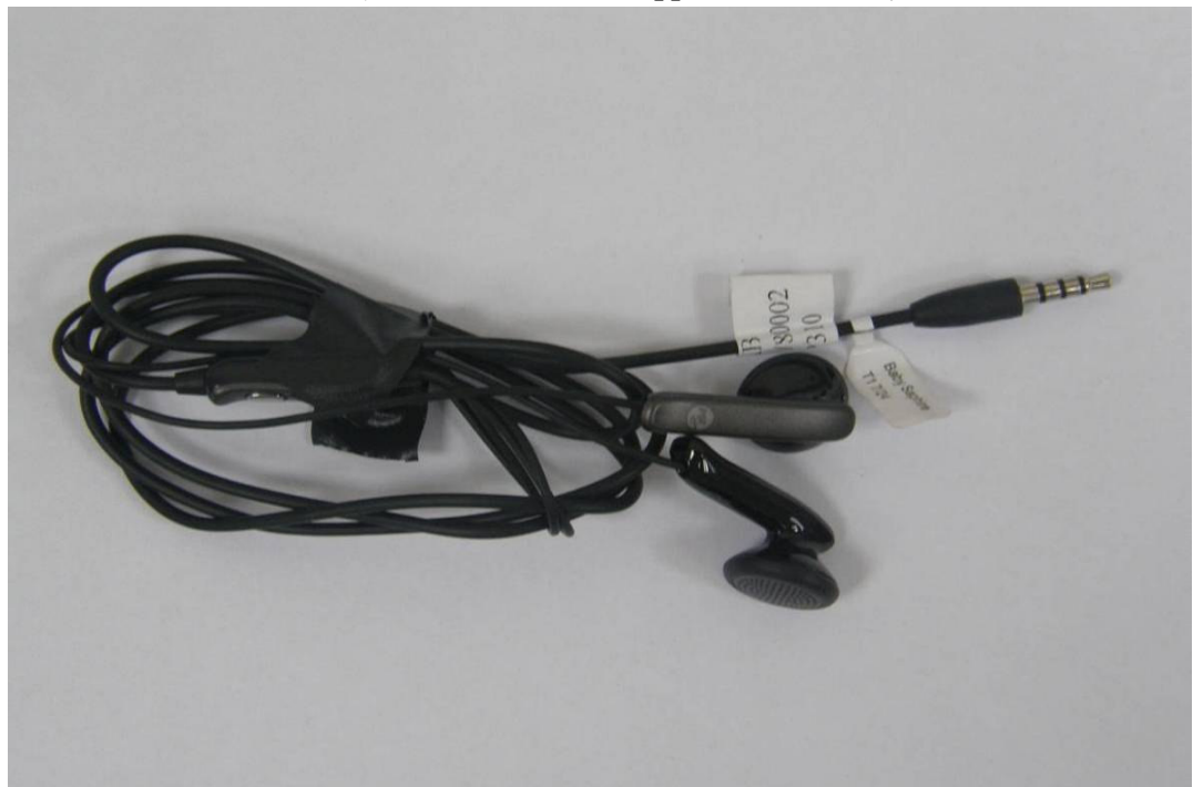
SHF(Model: HS U120, Supplier: COTRON)

Unless otherwise stated the results shown in this test report refer only to the sample(s) tested and such sample(s) are retained for 90 days only. This test report cannot be reproduced, except in full, without prior written permission of the Company. 除非另有說明,此報告結果僅對測試之樣品負責,同時此樣品僅保留90天。本報告未經本公司書面許可,不可部份複製。 This document is issued by the Company subject to its General Conditions of Service (<u>www.sgs.com/terms_e-document.htm</u>). Attention is drawn to the limitations of liability, indemnification and jurisdictional issues established therein. Even if printed this electronic document is to be treated as an original within the meaning of UCP 600 article 200. The authenticity of this document may be verified at <u>www.sgs.om/terms_endocument contained</u>. Any holder of this document is advised that information contained hereon reflects the Company's findings at the time of its intervention only and within the limits of client's instructions, if any. The Company's sole responsibility is to its Client at this document does not exonerate parties to a transaction from exercising all their rights and obligations under the transaction documents. SGS Taiwan Ltd. No.134, Wu Kung Road, Wuku Industrial Zone, Taipei County, Taiwan / 台北縣五展工業區五工路 134 號 (1886-2) 2299-3279 f (1886-2) 2298-0488 www.twg.com