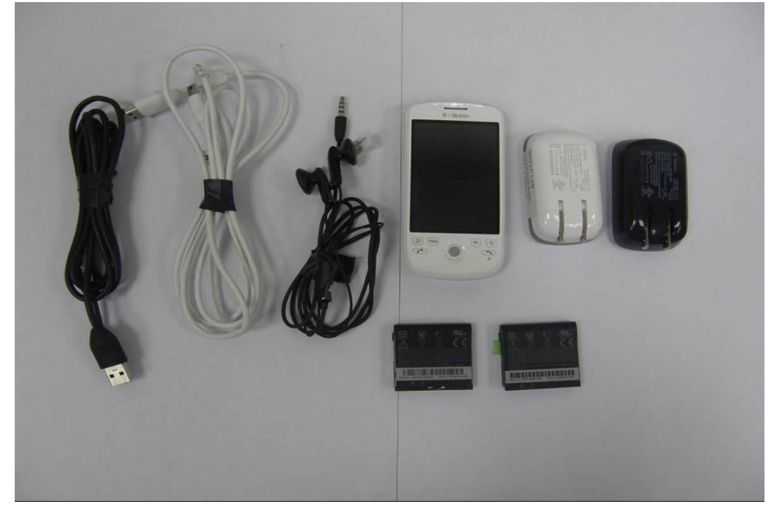
Front View of EUT (White)