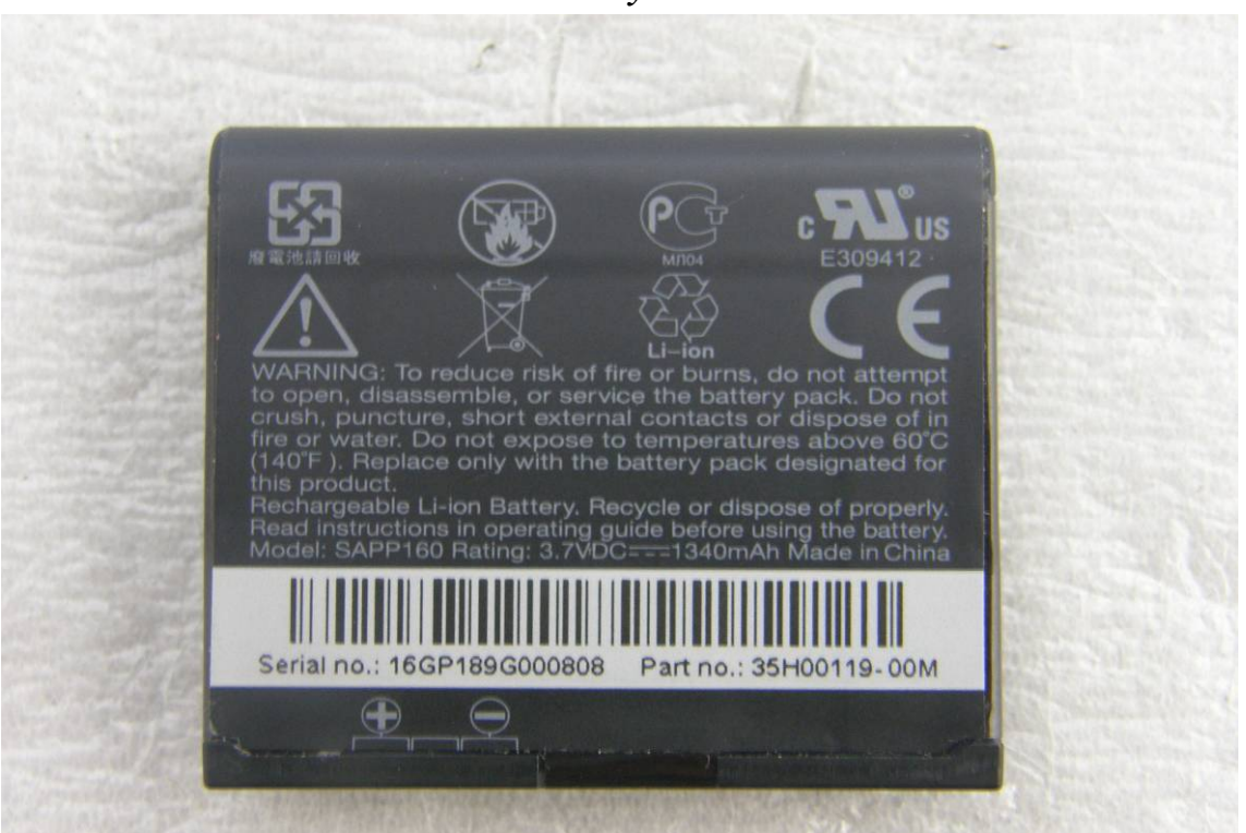
Battery - 2