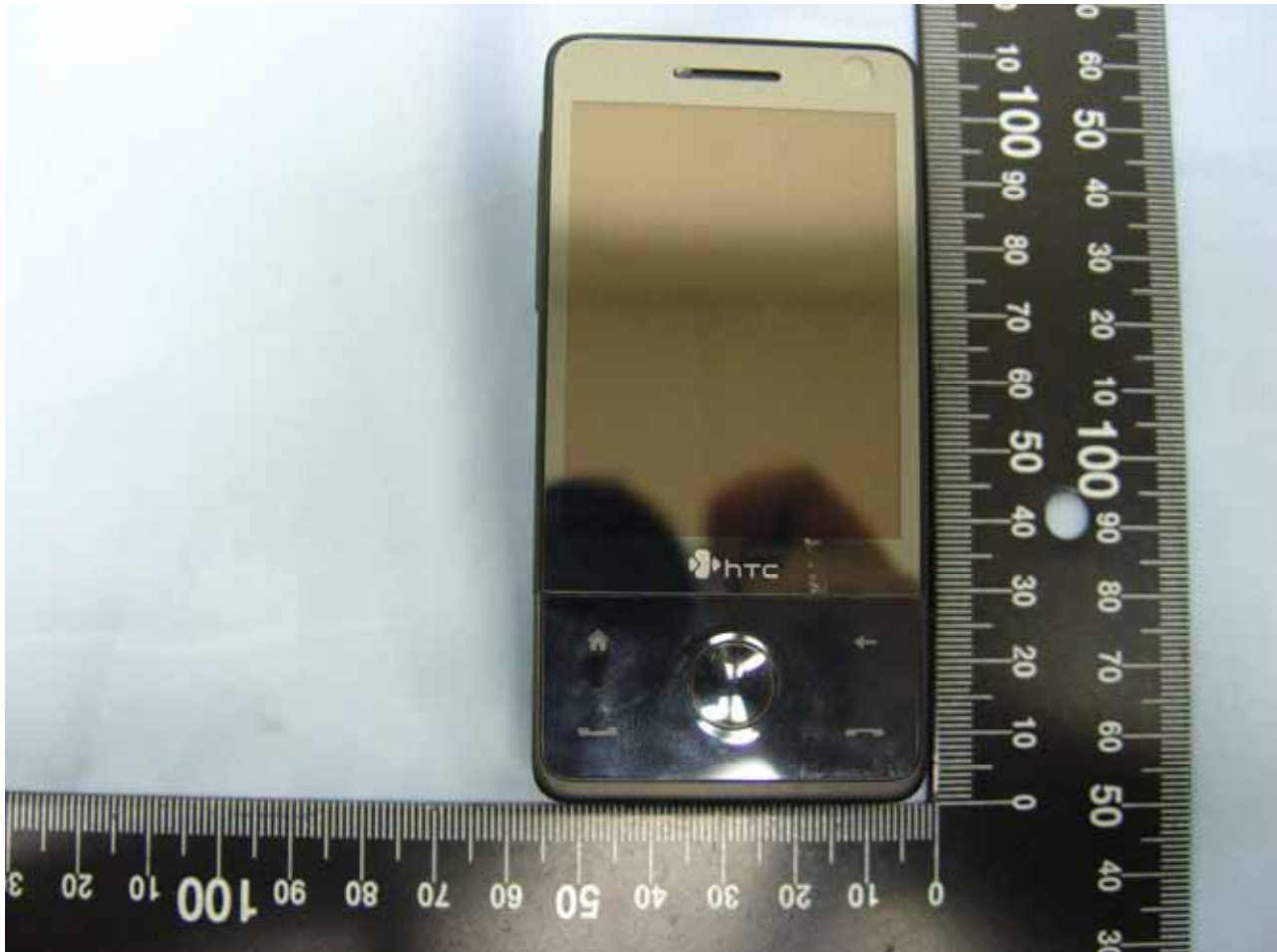
PDA Phone 2

Model Name: RAPH600 Marketing Name: HT-01A