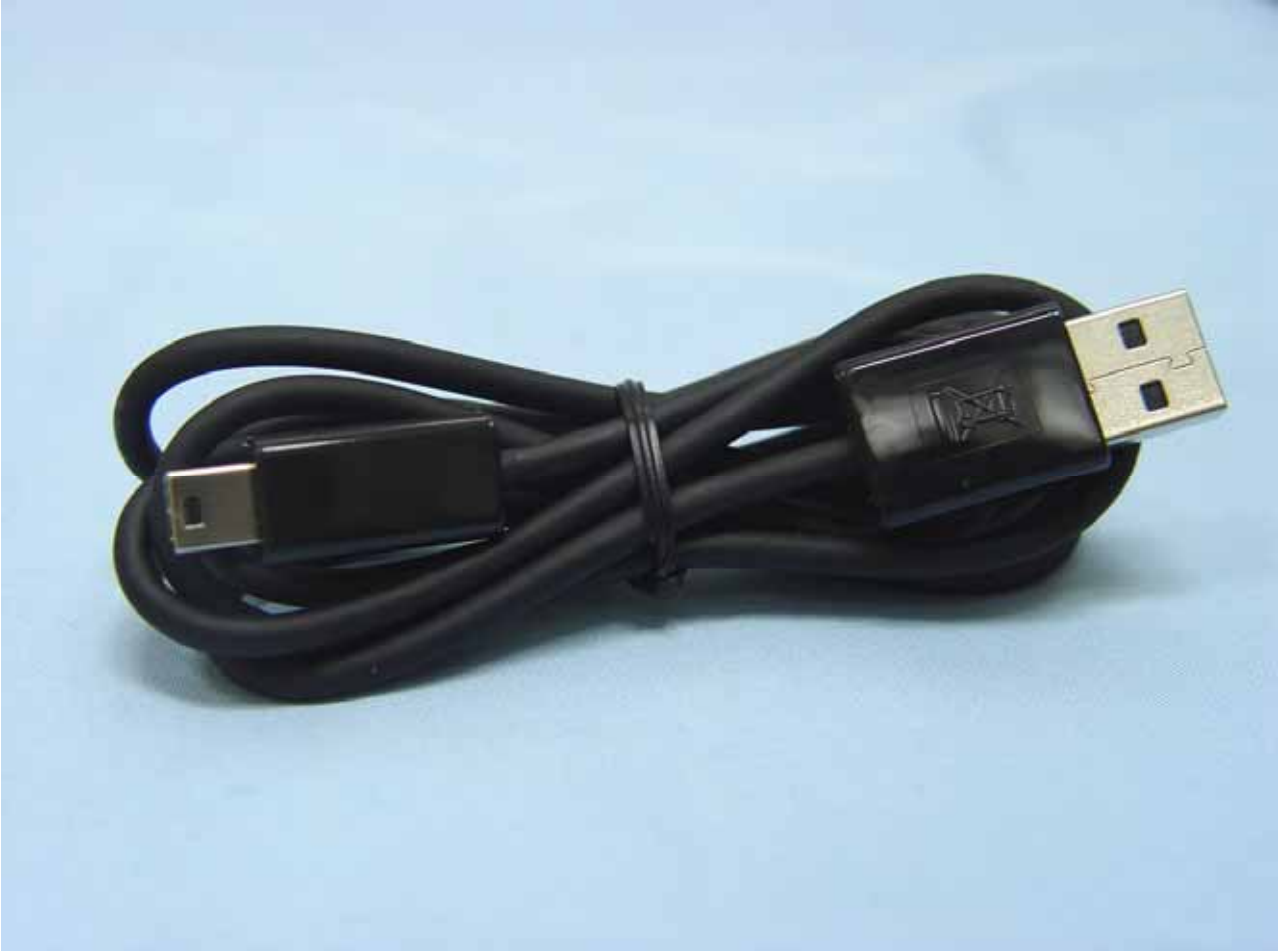
USB Cable 1

Model Name: RAPH600 Marketing Name: HT-01A