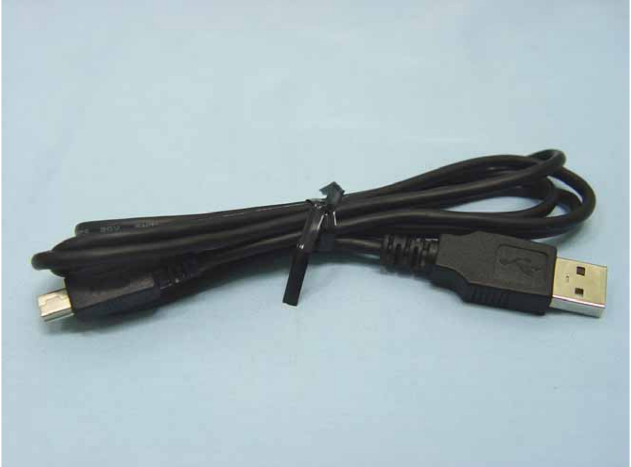
USB Cable 2

Model Name: RAPH600 Marketing Name: HT-01A