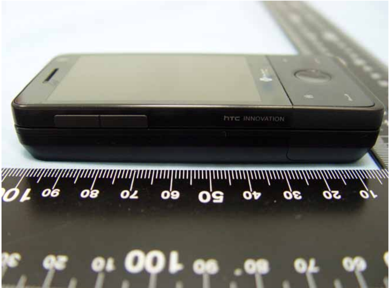
PDA Phone 2

Model Name: RAPH600 Marketing Name: HT-01A