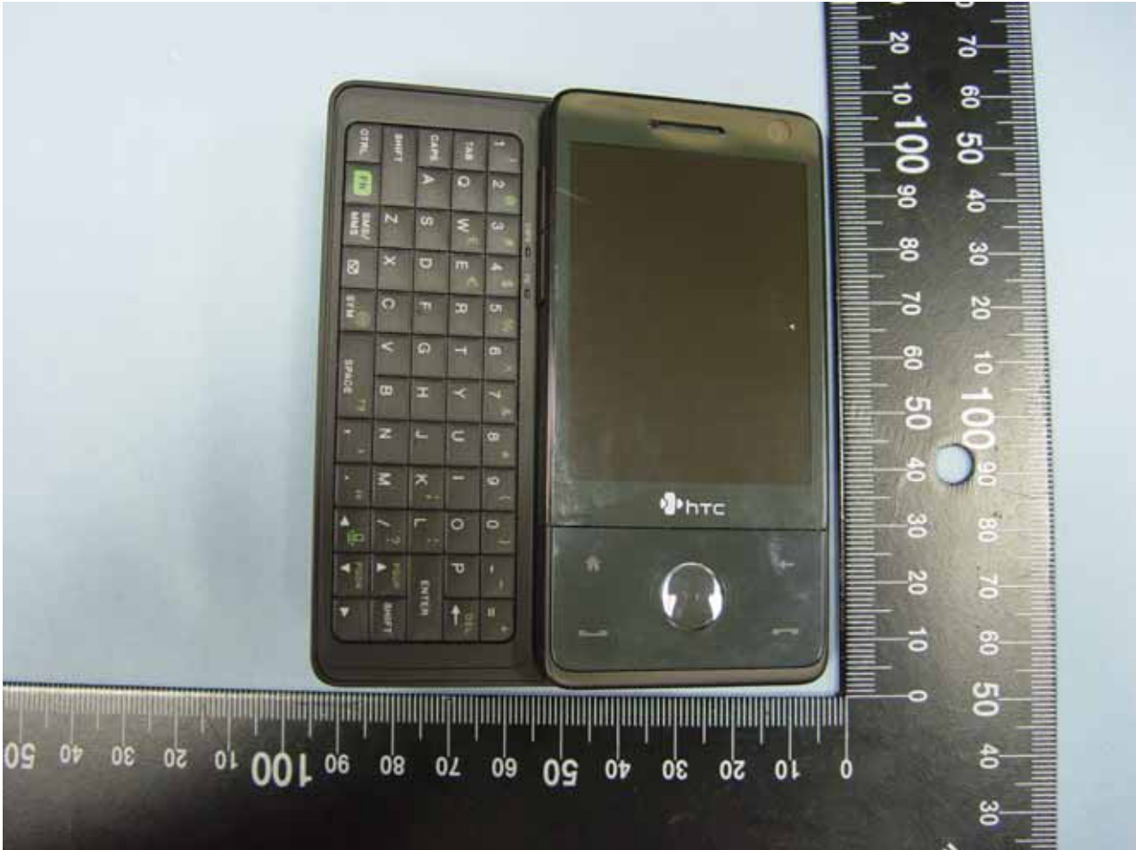
PDA Phone 1

Model Name: RAPH600 Marketing Name: HT-01A