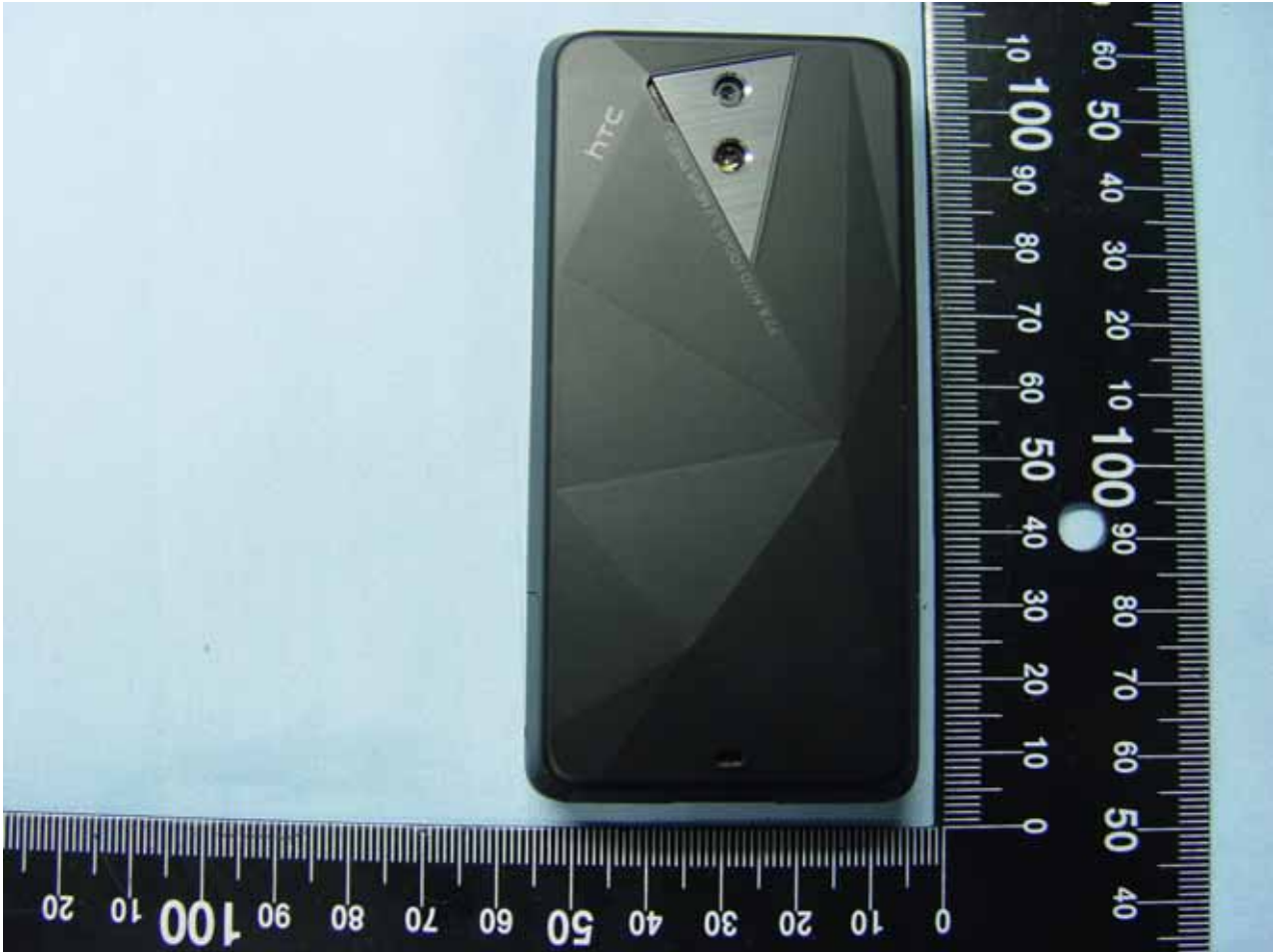
PDA Phone 2

Model Name: RAPH600 Marketing Name: HT-01A