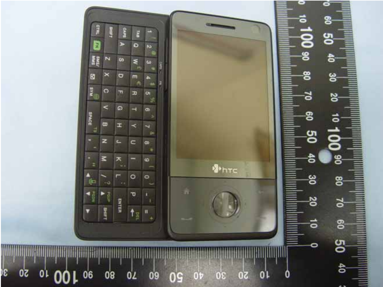
PDA Phone 2

Model Name: RAPH600 Marketing Name: HT-01A