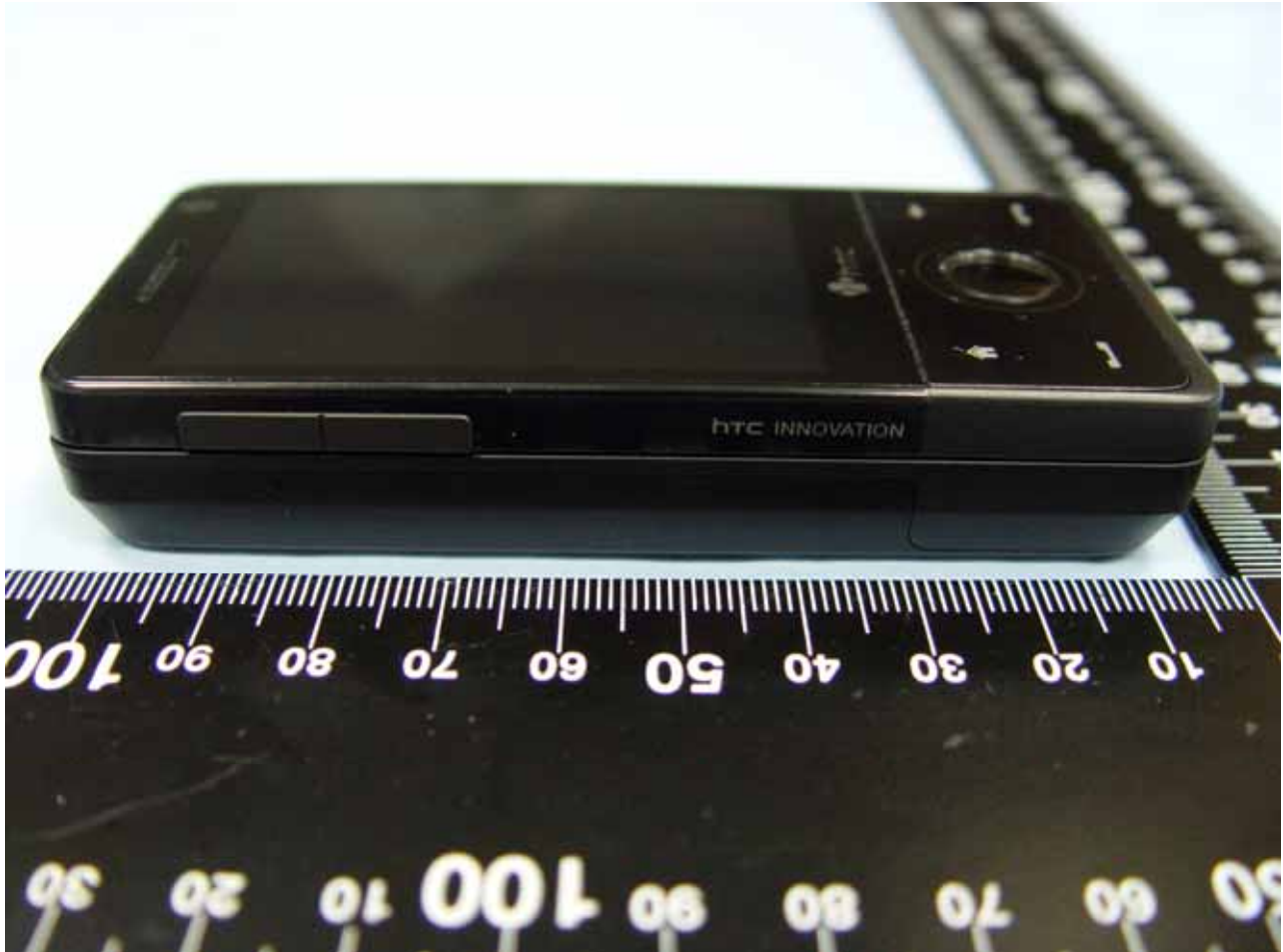
PDA Phone 1

Model Name: RAPH600 Marketing Name: HT-01A