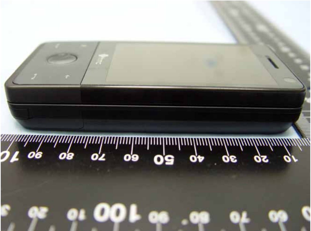
PDA Phone 2

Model Name: RAPH600 Marketing Name: HT-01A