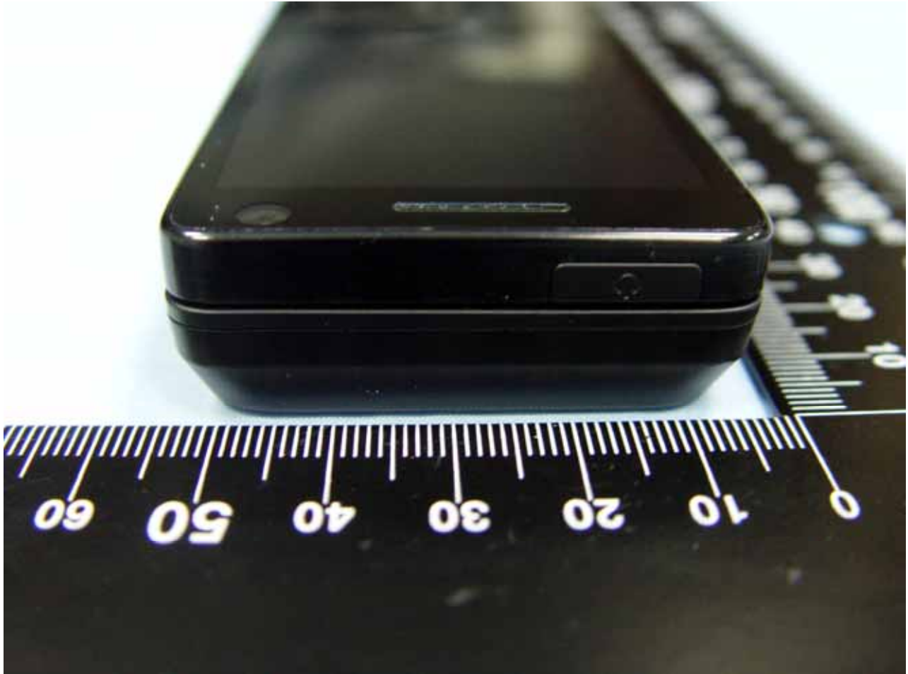
PDA Phone 1

Model Name: RAPH600 Marketing Name: HT-01A