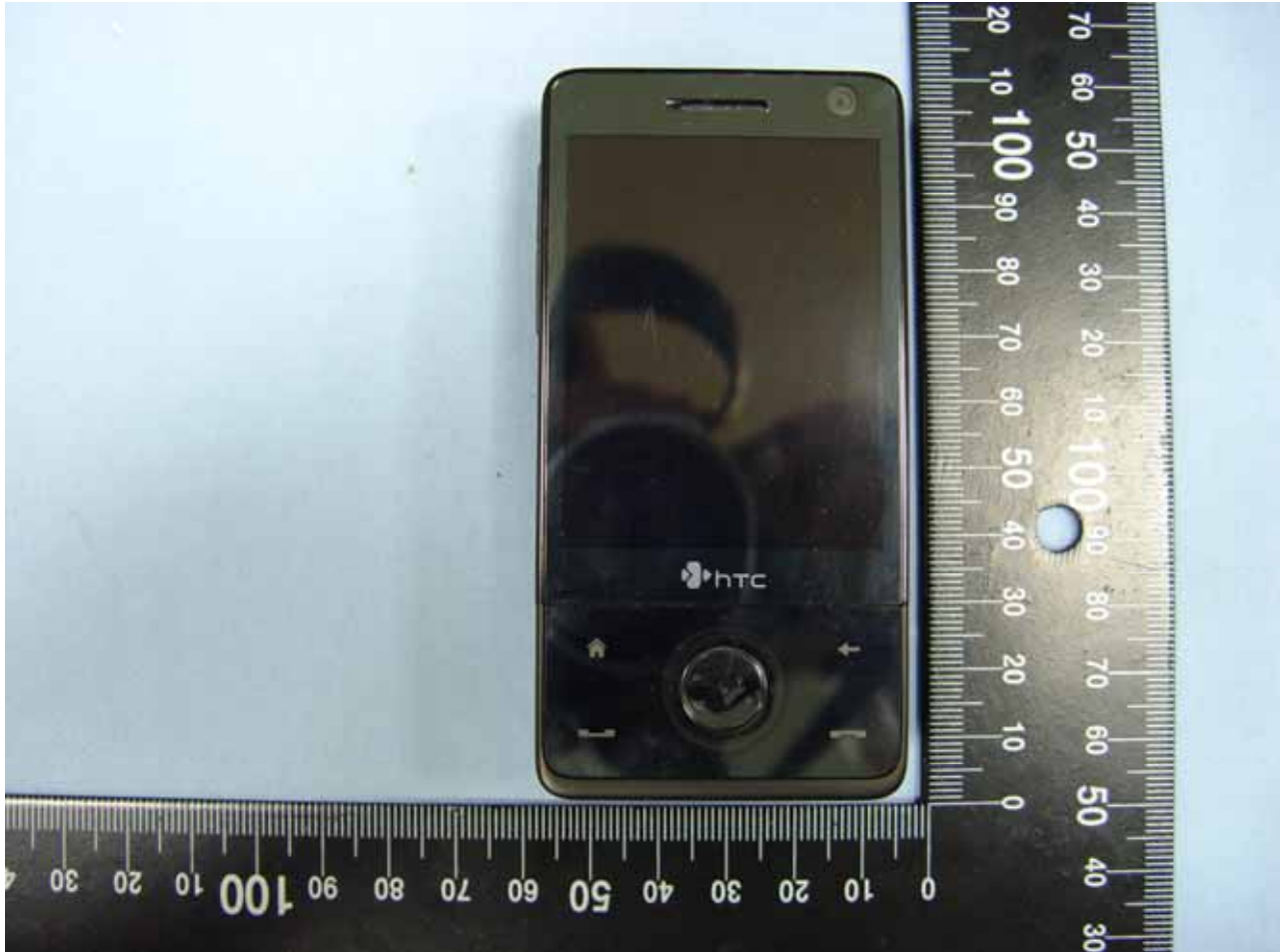
PDA Phone 1

Model Name: RAPH600 Marketing Name: HT-01A