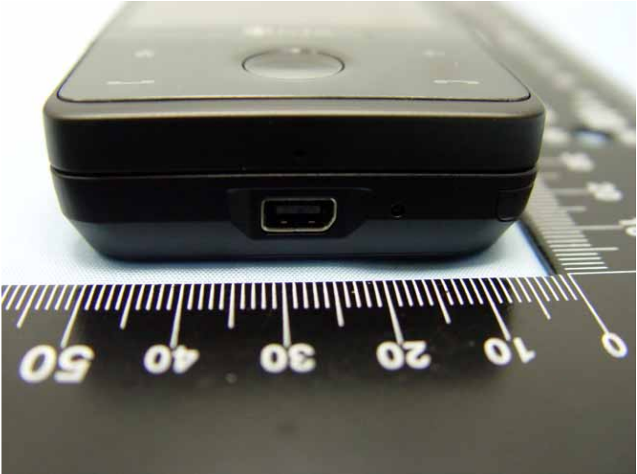
PDA Phone 2

Model Name: RAPH600 Marketing Name: HT-01A