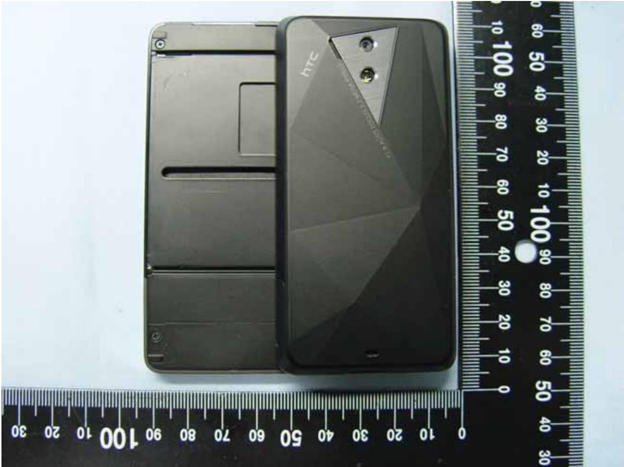
PDA Phone 2

Model Name: RAPH600 Marketing Name: HT-01A