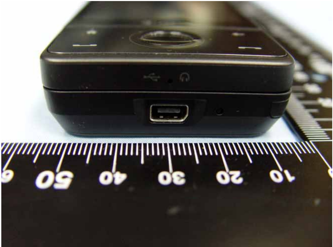
PDA Phone 1

Model Name: RAPH600 Marketing Name: HT-01A