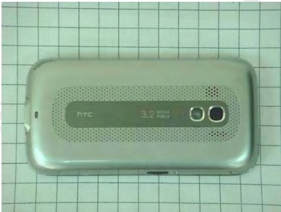
Fig.4 Back view of device

Unless otherwise stated the results shown in this test report refer only to the sample(s) tested and such sample(s) are retained for 90 days only. This test report cannot be reproduced, except in full, without prior written permission of the Company. 除非另有說明，此報告結果僅對測試之樣品負責，同時此樣品僅保留90天。本報告未經本公司書面許可，不可部份複製。