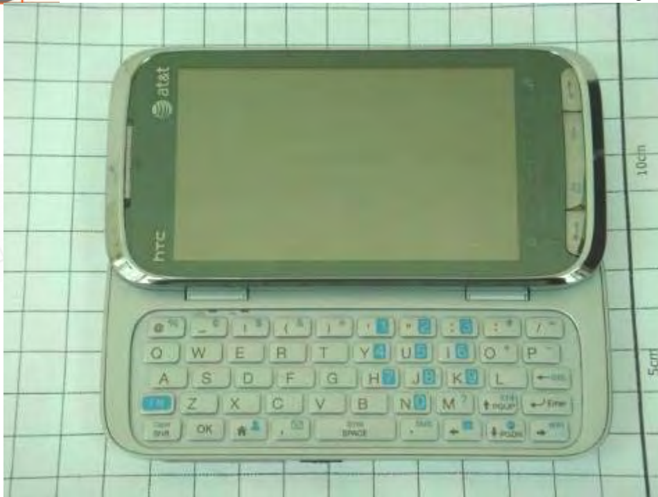
Fig.5 Front view of device( Slider on)