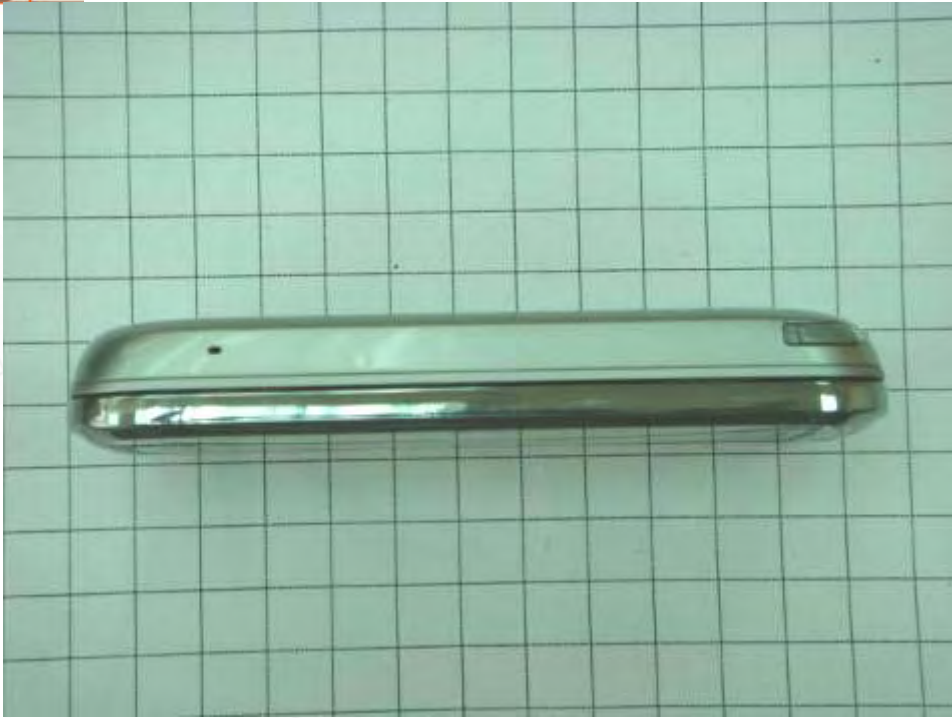
Fig.7 Right side view of device