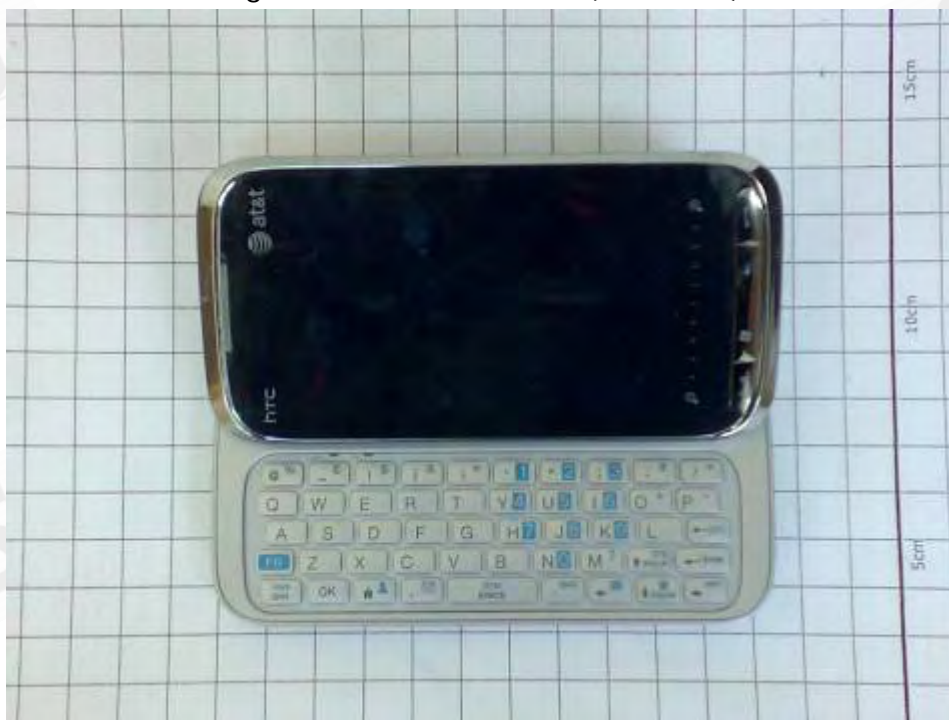
Fig.6 Front view of device( Hold up)

Unless otherwise stated the results shown in this test report refer only to the sample(s) tested and such sample(s) are retained for 90 days only. This test report cannot be reproduced, except in full, without prior written permission of the Company. 除非另有說明，此報告結果僅對測試之樣品負責，同時此樣品僅保留90天。本報告未經本公司書面許可，不可部份複製。