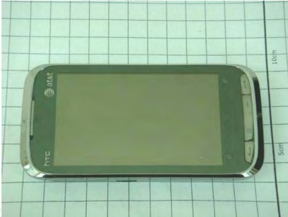
Fig.3 Front view of device(Slider off)