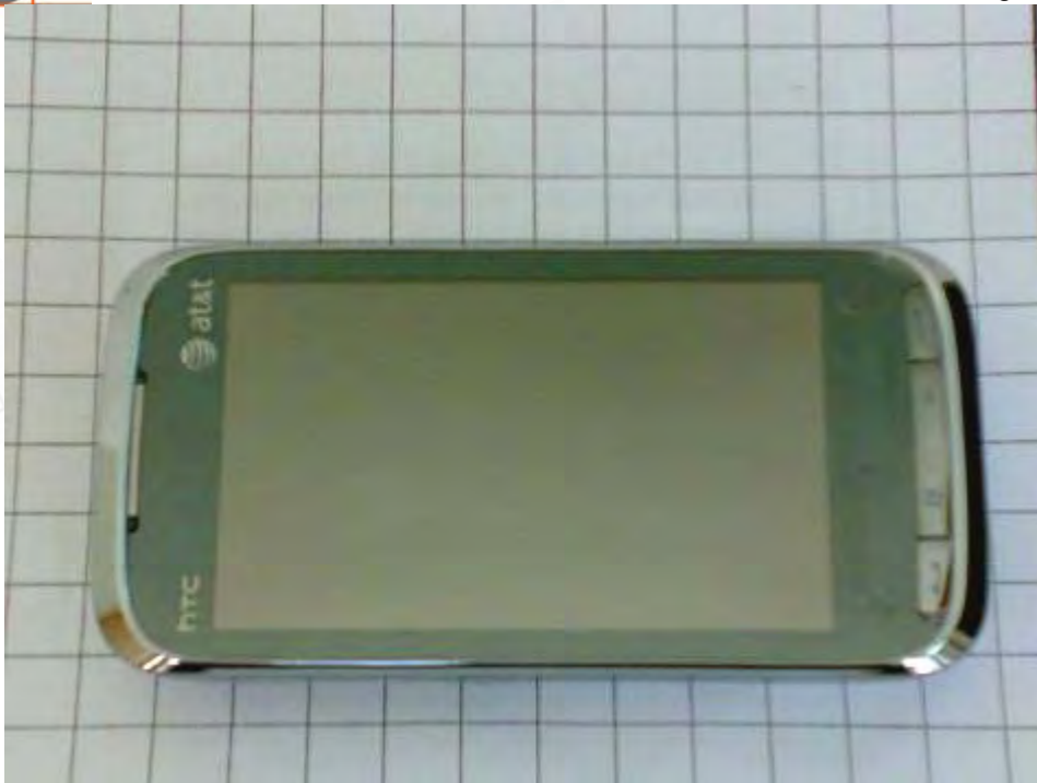
Fig.10 Front view of second solution