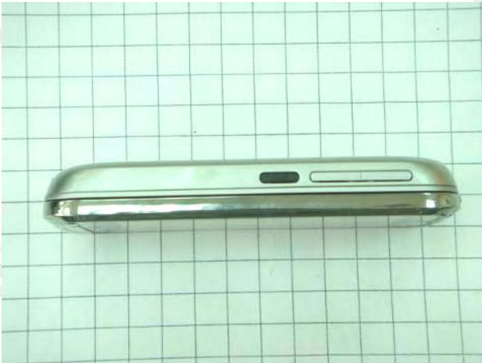
Fig.8 Left side view of device

Unless otherwise stated the results shown in this test report refer only to the sample(s) tested and such sample(s) are retained for 90 days only. This test report cannot be reproduced, except in full, without prior written permission of the Company. 除非另有說明，此報告結果僅對測試之樣品負責，同時此樣品僅保留90天。本報告未經本公司書面許可，不可部份複製。