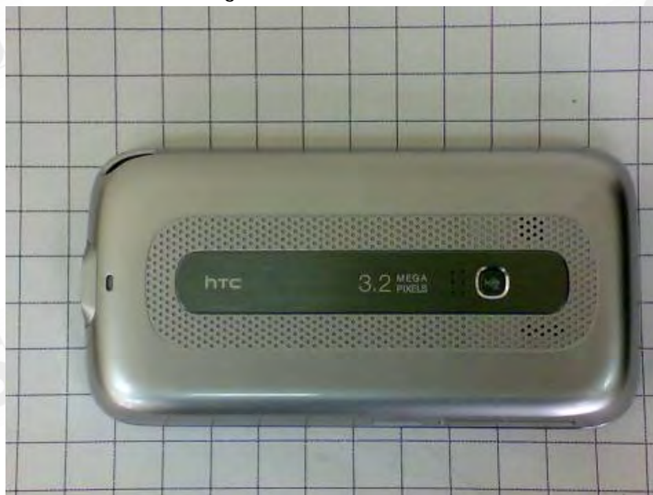
Fig.11 Back view of second solution