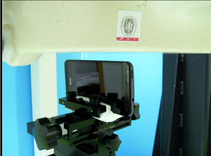
Left Side of EUT with 1.0 cm Gap