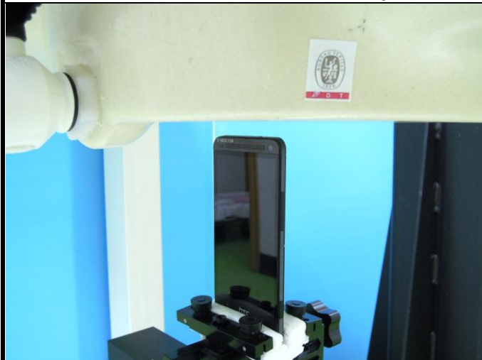
Top Side of EUT with 1.0 cm Gap