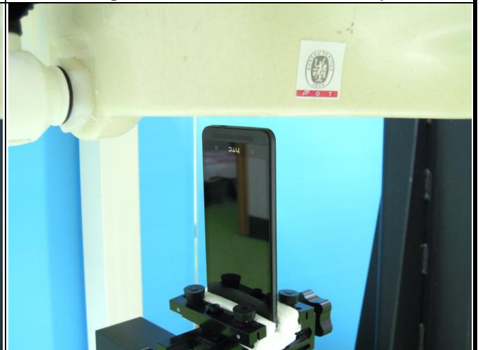
Bottom Side of EUT with 1.0 cm Gap