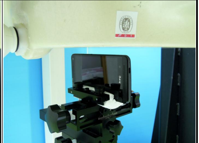
Right Side of EUT with 1.0 cm Gap