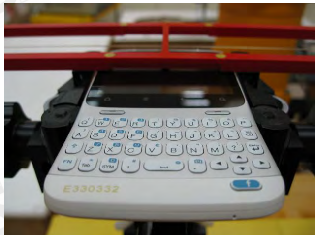
Fig.2 Receiver of mobile contact center of Arch.

Unless otherwise stated the results shown in this test report refer only to the sample(s) tested and such sample(s) are retained for 90 days only. 除非另有說明，此報告結果僅對測試之樣品負責，同時此樣品僅保留90天。本報告未經本公司書面許可，不可部份複製。