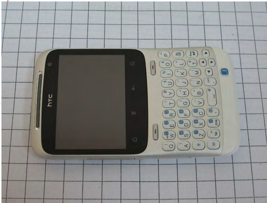
Fig 5 Front view of device (2 nd source)