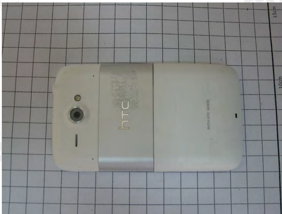
Fig 4 Back view of device

Unless otherwise stated the results shown in this test report refer only to the sample(s) tested and such sample(s) are retained for 90 days only. 除非另有說明，此報告結果僅對測試之樣品負責，同時此樣品僅保留90天。本報告未經本公司書面許可，不可部份複製。