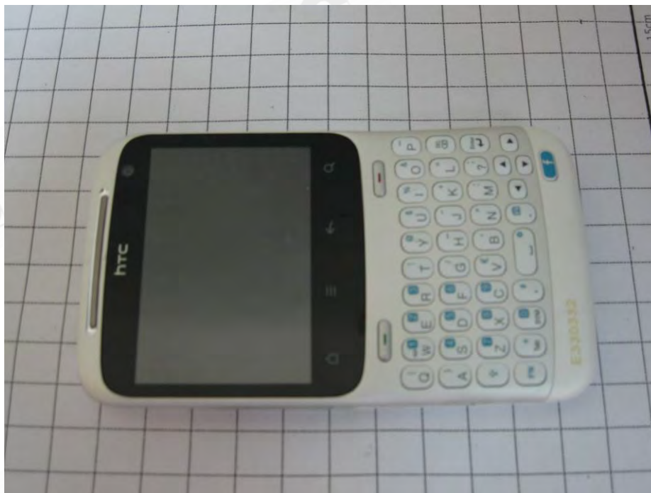
Fig.3 Front view of device