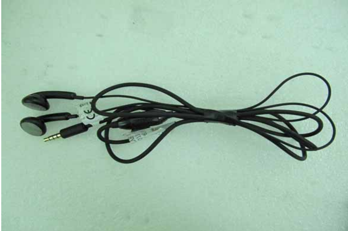
SHF – 3(Brand Name: COTRON, model: RC E160)