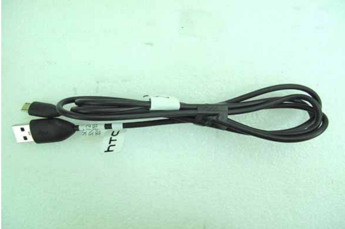
SHF – 1(Brand Name: KINGSTATE, model: HS G235)