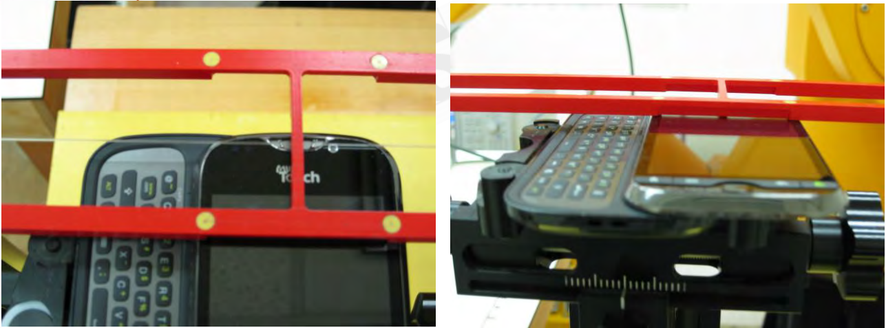
Fig.3 Receiver of mobile contact center of Arch. (Slider on)

Unless otherwise stated the results shown in this test report refer only to the sample(s) tested and such sample(s) are retained for 90 days only. 除非另有說明，此報告結果僅對測試之樣品負責，同時此樣品僅保留90天。本報告未經本公司書面許可，不可部份複製。