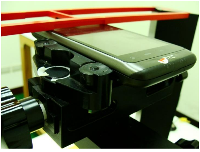
Right Side View-Slide Off Mode for Sample 1