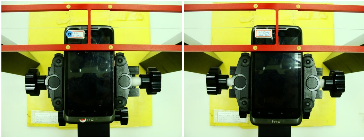
Front View-Slide Off Mode for Sample 1