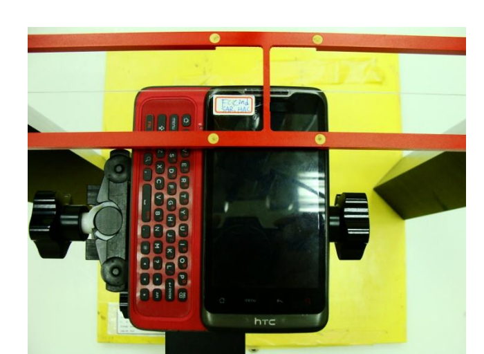
Front View-Slide Right Mode for Sample 2