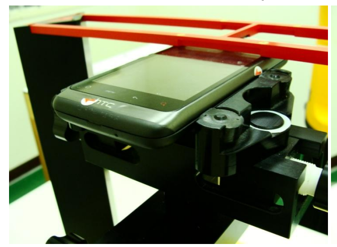
Left Side View-Slide Off Mode for Sample 1