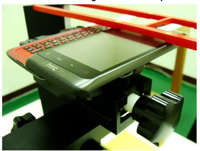
Left Side View-Slide Right Mode for Sample 2