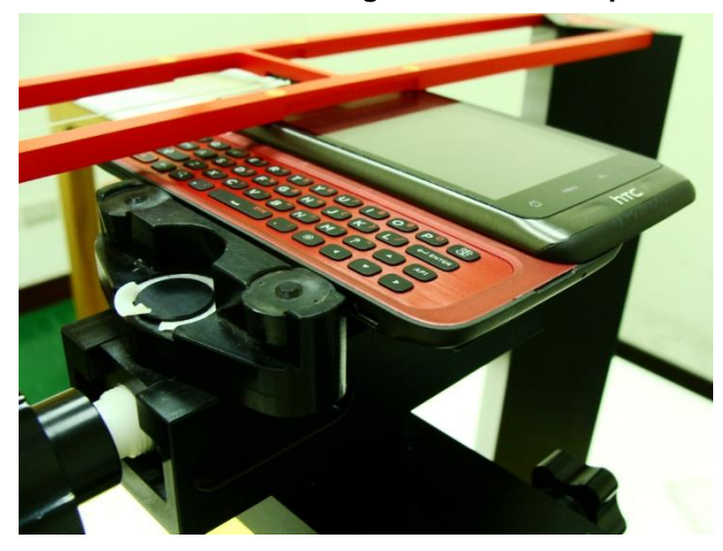
Right Side View-Slide Right Mode for Sample 2