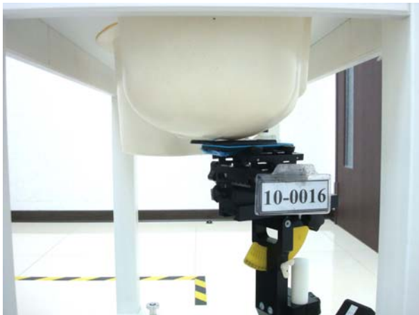
Figure 3. Right Head SAR Test Setup (Cheek) _Open