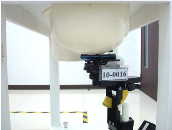
Figure 1. Right Head SAR Test Setup (Cheek) _Close