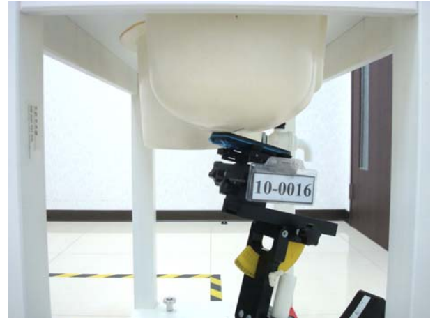
Figure 2. Right Head SAR Test Setup (Tilted) _Close