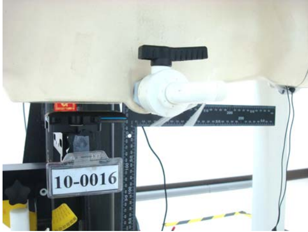
Figure 9. Body SAR Test Setup (Flat Section)_Close