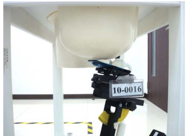
Figure 4. Right Head SAR Test Setup (Tilted) _Open