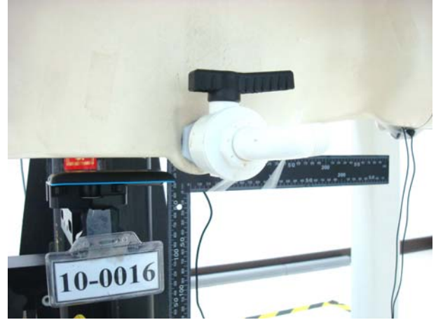
Figure 10. Body SAR Test Setup (Flat Section)_Open