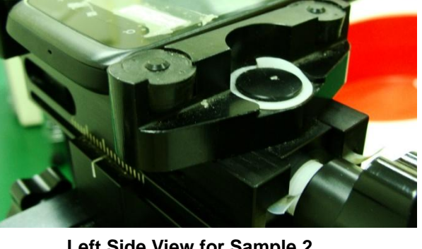
Left Side View for Sample 2