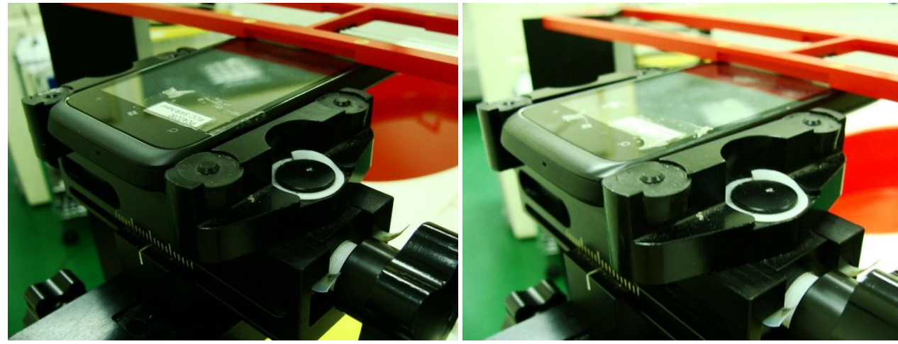
Left Side View for Sample 1