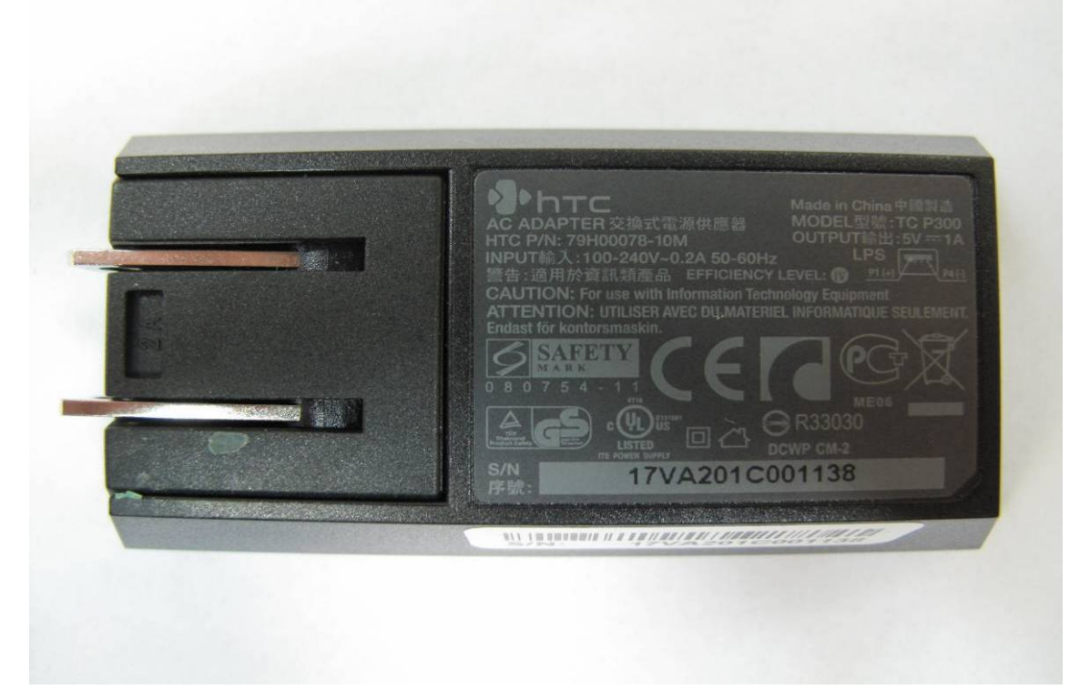
Adapter-4(TC P300, Brand: Foxlink)