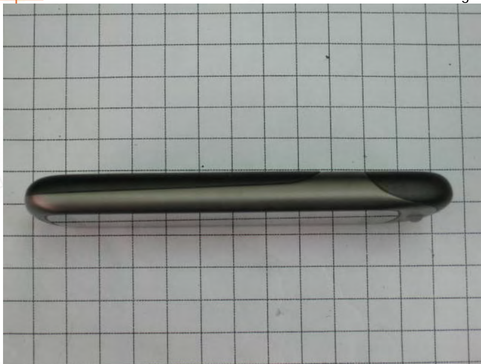
Fig.5 Right side view of device