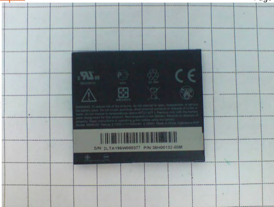
Fig.7 Front view of Battery (Formasa)