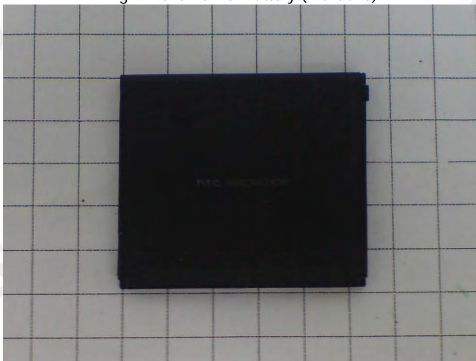
Fig.10 Back view of Battery (Welldone)

Unless otherwise stated the results shown in this test report refer only to the sample(s) tested and such sample(s) are retained for 90 days only. This test report cannot be reproduced, except in full, without prior written permission of the Company. 除非另有說明，此報告結果僅對測試之樣品負責，同時此樣品僅保留90天。本報告未經本公司書面許可，不可部份複製。