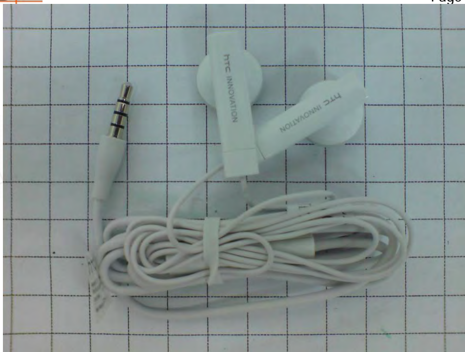
Fig.13 Headset0020(Merry/RC E151)