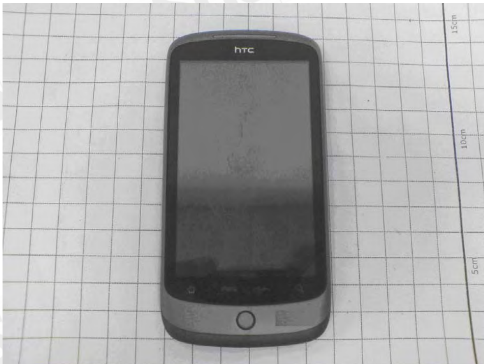
Fig.3 Front view of device