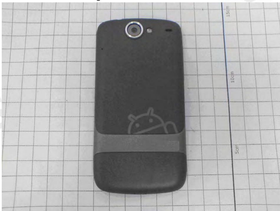
Fig.4 Back view of device

Unless otherwise stated the results shown in this test report refer only to the sample(s) tested and such sample(s) are retained for 90 days only. This test report cannot be reproduced, except in full, without prior written permission of the Company. 除非另有說明，此報告結果僅對測試之樣品負責，同時此樣品僅保留90天。本報告未經本公司書面許可，不可部份複製。