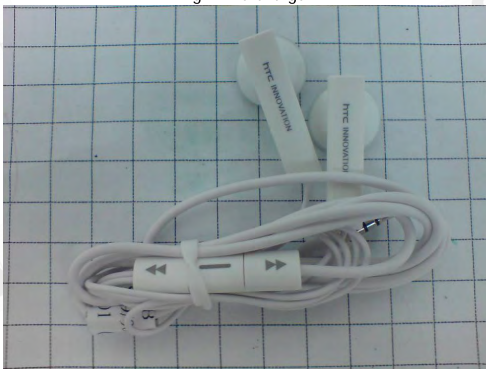
Fig.12 Headset (Cotron/RC E151)

Unless otherwise stated the results shown in this test report refer only to the sample(s) tested and such sample(s) are retained for 90 days only. This test report cannot be reproduced, except in full, without prior written permission of the Company. 除非另有說明，此報告結果僅對測試之樣品負責，同時此樣品僅保留90天。本報告未經本公司書面許可，不可部份複製。