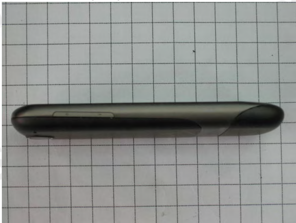
Fig.6 Left side view of device

Unless otherwise stated the results shown in this test report refer only to the sample(s) tested and such sample(s) are retained for 90 days only. This test report cannot be reproduced, except in full, without prior written permission of the Company. 除非另有說明，此報告結果僅對測試之樣品負責，同時此樣品僅保留90天。本報告未經本公司書面許可，不可部份複製。