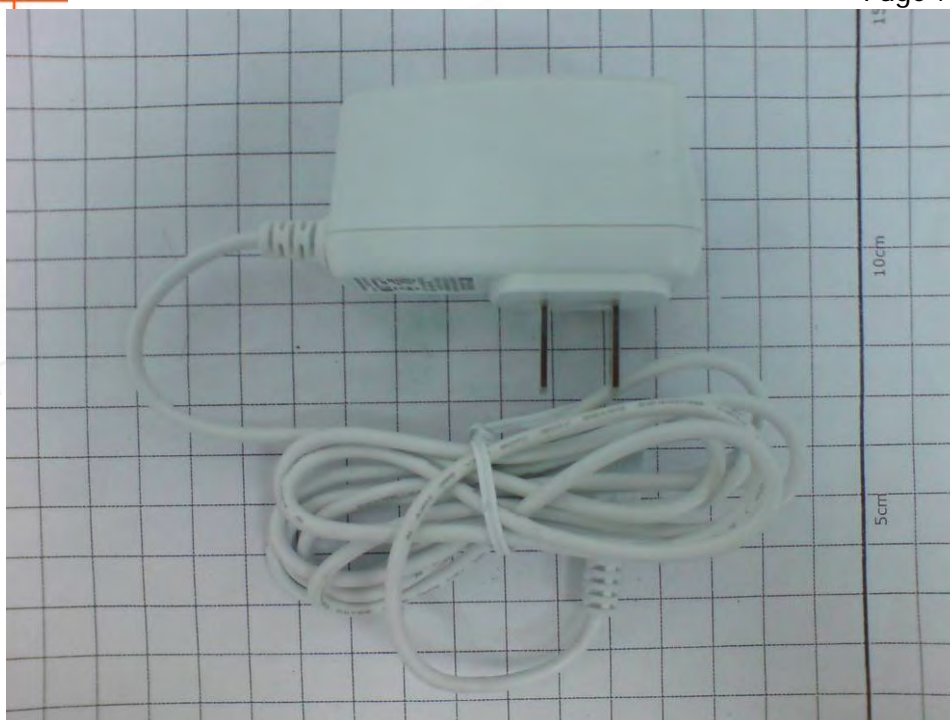
Fig.11 AC Charger