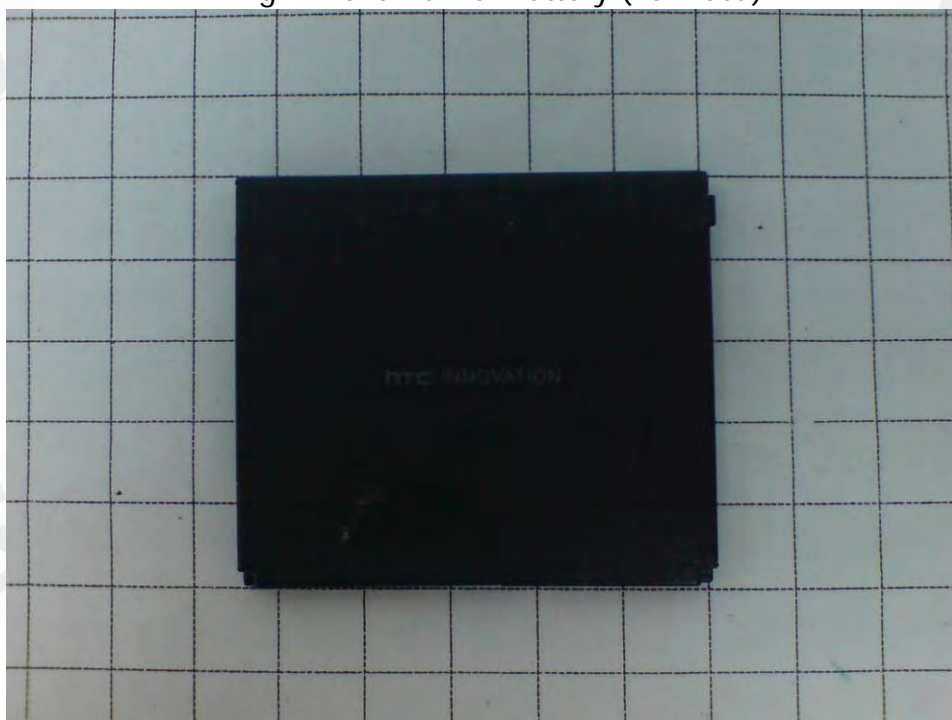
Fig.8 Back view of Battery (Formasa)

Unless otherwise stated the results shown in this test report refer only to the sample(s) tested and such sample(s) are retained for 90 days only. This test report cannot be reproduced, except in full, without prior written permission of the Company. 除非另有說明，此報告結果僅對測試之樣品負責，同時此樣品僅保留90天。本報告未經本公司書面許可，不可部份複製。