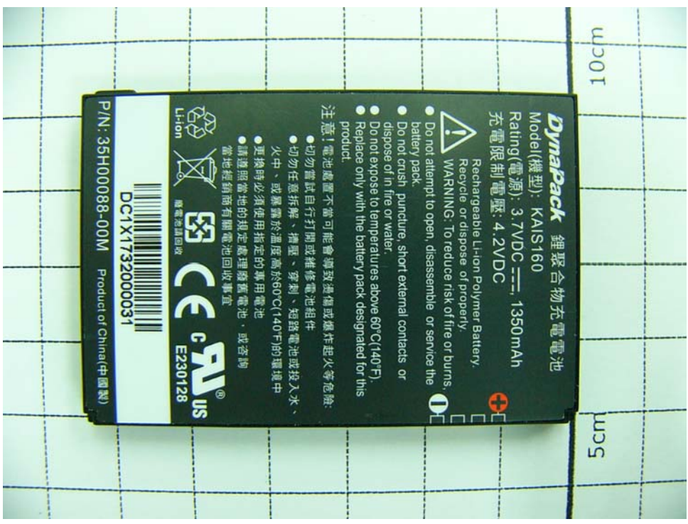
Fig.25 Front view of DynaPack Battery