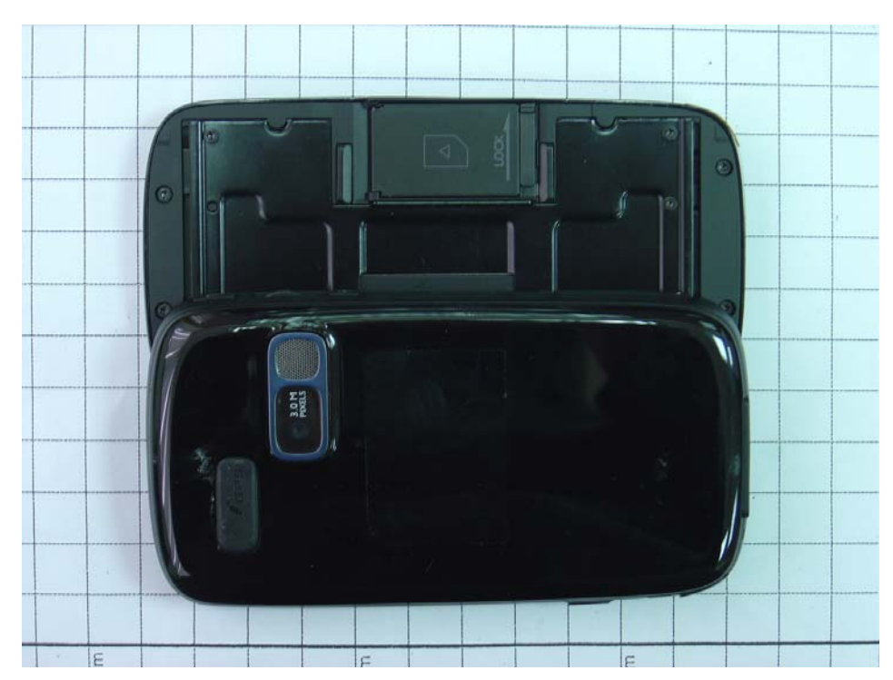
Fig.18 Back view of device (Slider on)