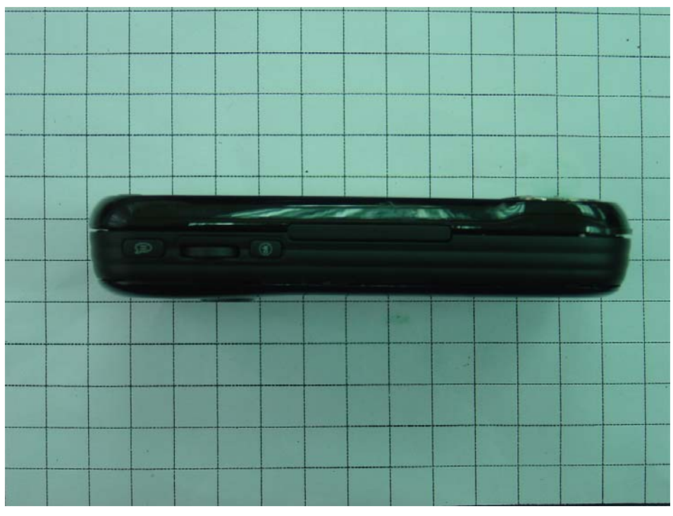
Fig.20 Left side view of device