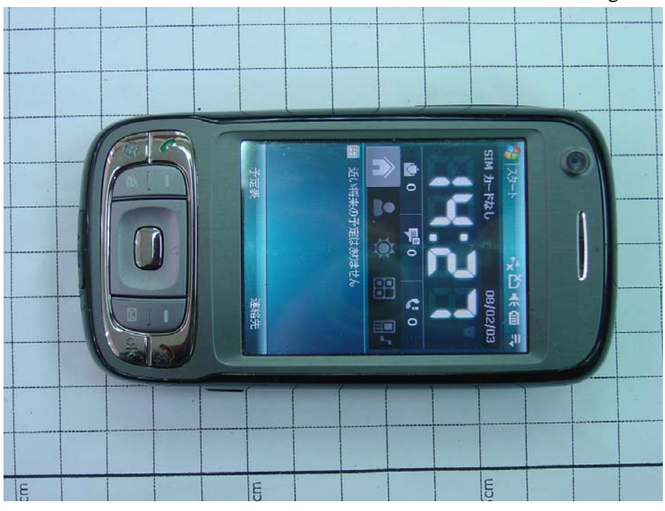
Fig.23 Second solution (changed LCM & Camera)

Report No.: ES/2008/20001 Page: 12 of 14