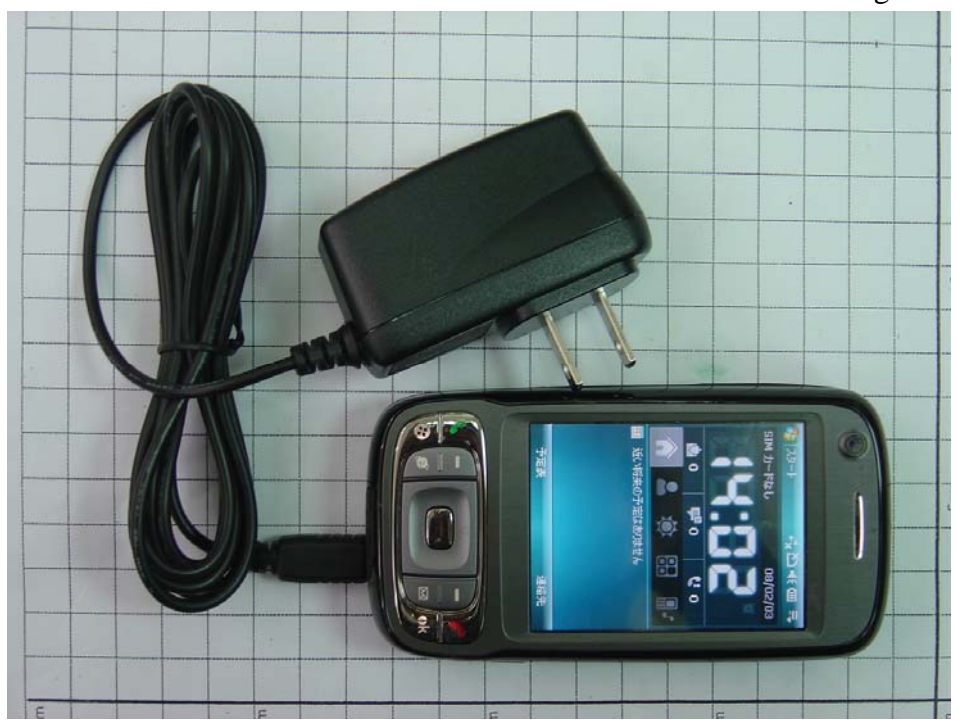
Fig.21 Mobile with AC Charger

Report No.: ES/2008/20001 Page: 11 of 14