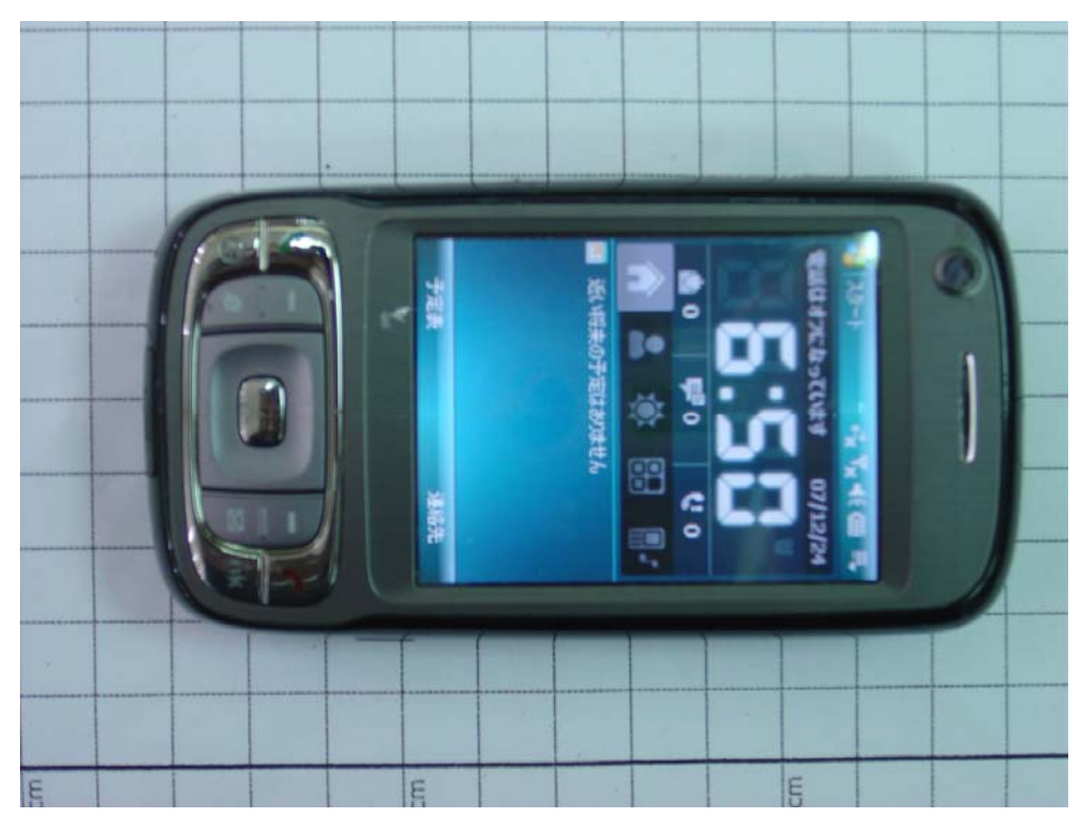
Fig.15 Front view of device