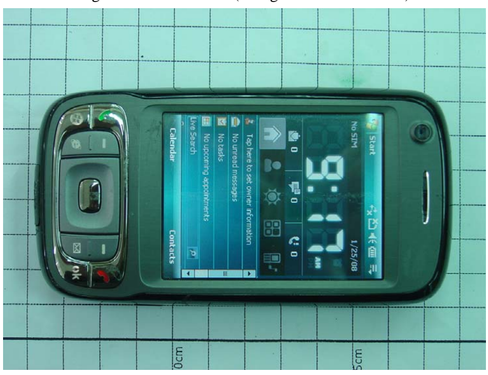
Fig.24 Third solution (changed PA)