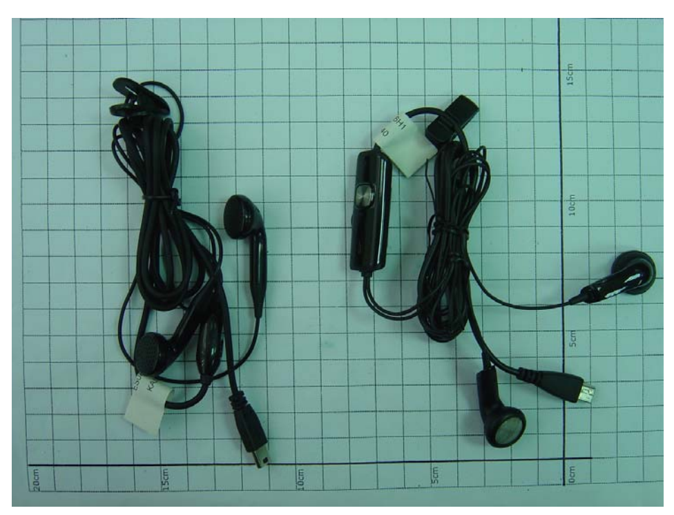
Fig.22 Accessories (Headset 1 and Headset 2)