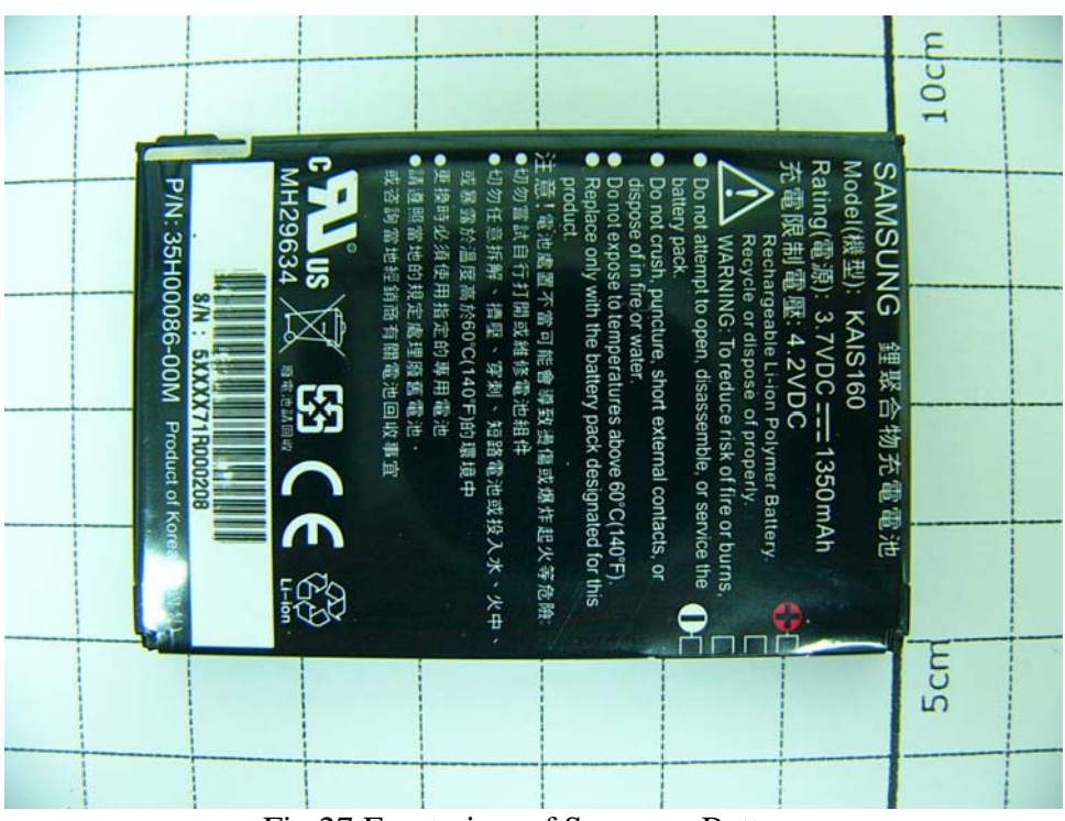
Fig.27 Front view of Samsung Battery

Report No. : ES/2008/20001 Page : 14 of 14