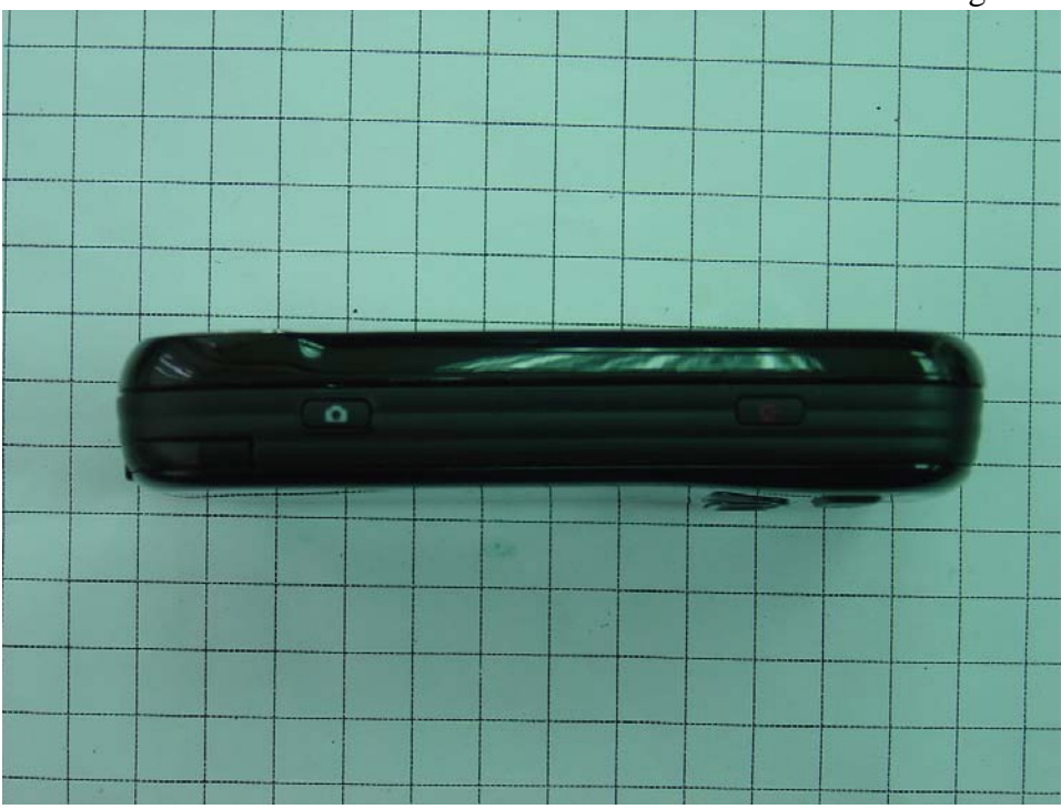
Fig.19 Right side view of device

Report No.: ES/2008/20001 Page: 10 of 14