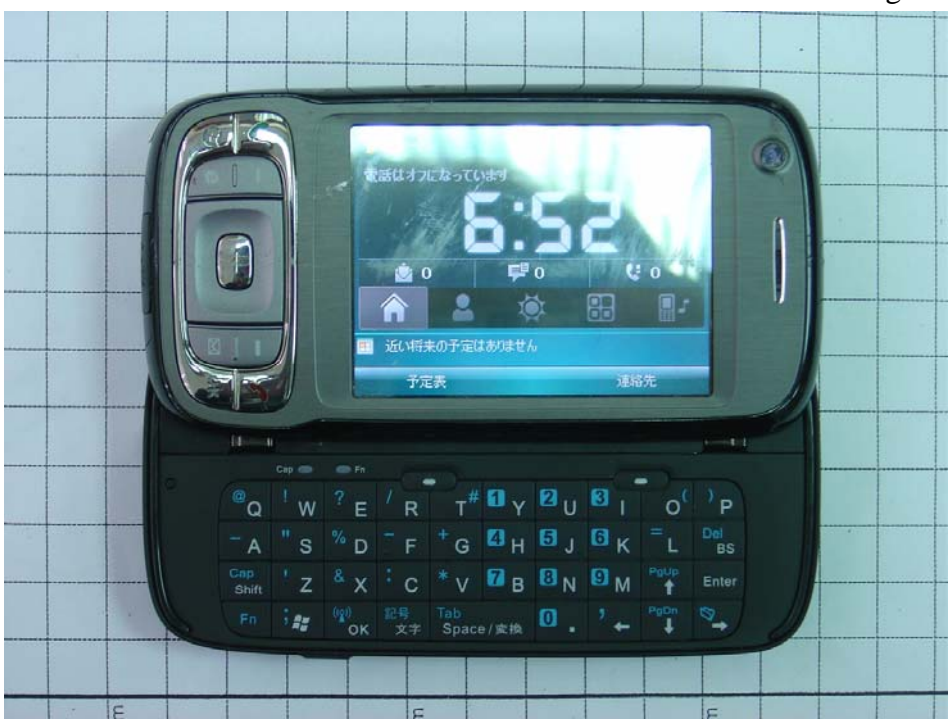
Fig.17 Front view of device (Slider on)