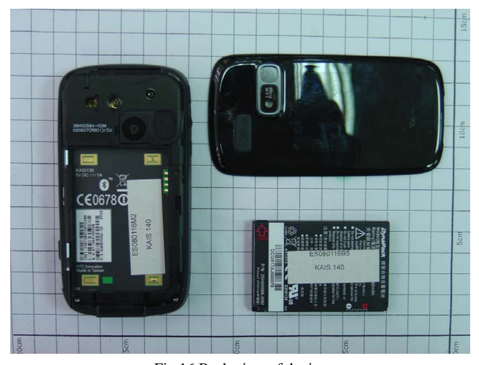
Fig.16 Back view of device