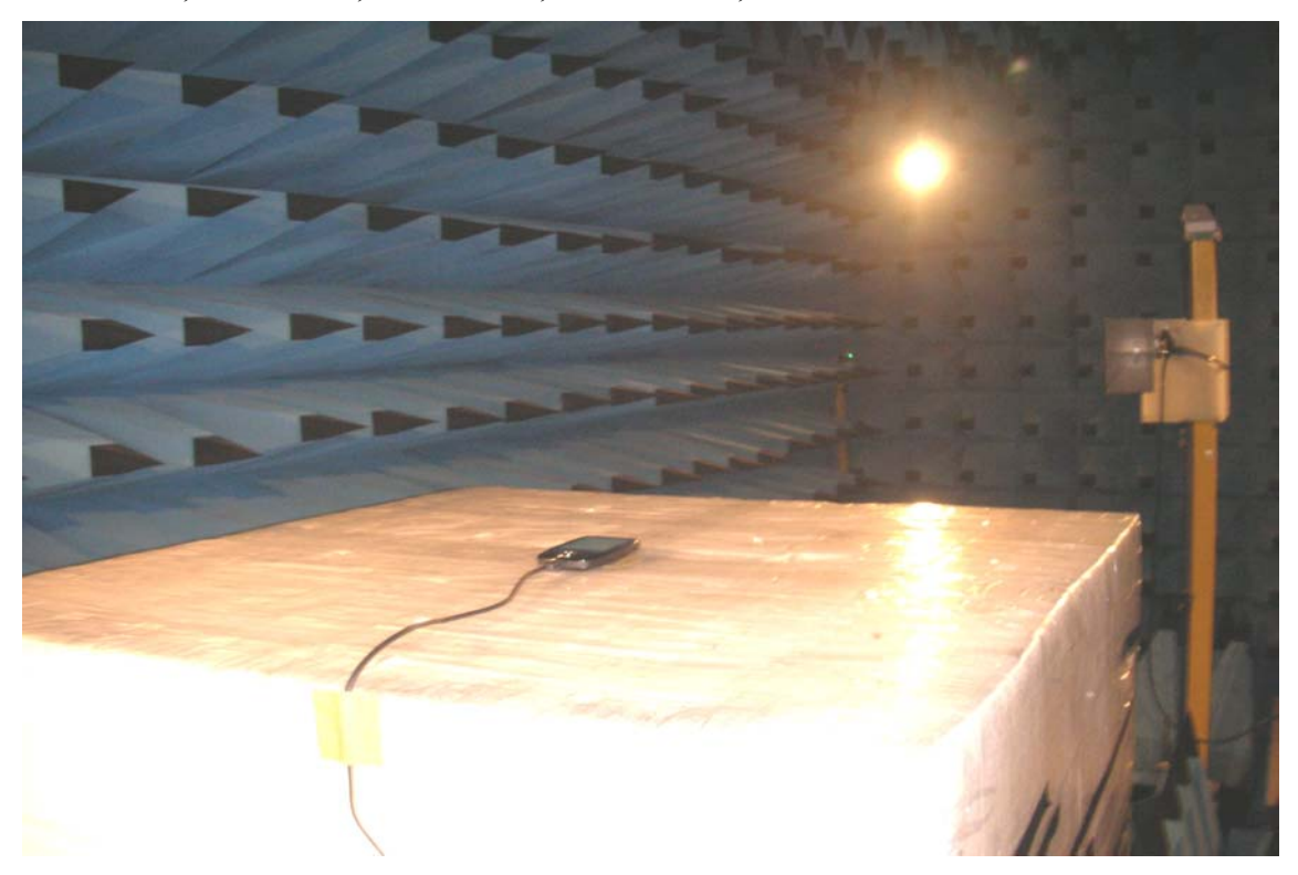
GSM 850 / Y Mode