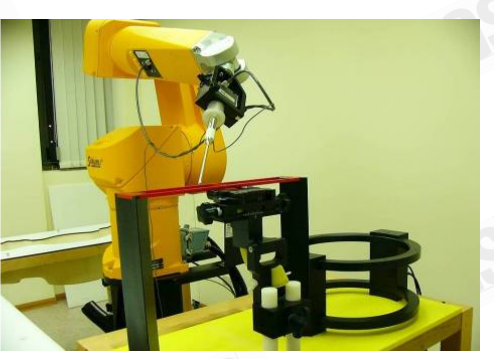
Fig.1 Photograph of the DASY 4 measurement System