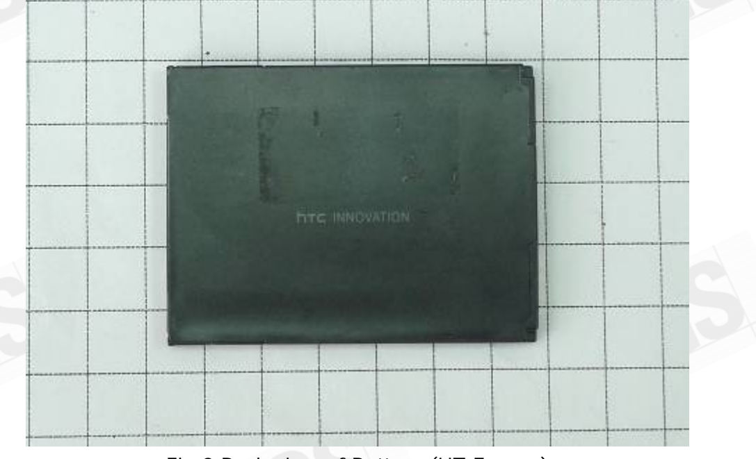
Fig.8 Back view of Battery (HT Energy)

Unless otherwise stated the results shown in this test report refer only to the sample(s) tested and such sample(s) are retained for 90 days only. This test report cannot be reproduced, except in full, without prior written permission of the Company. 除非另有說明,此報告結果僅對測試之樣品負責,同時此樣品僅保留90天。本報告未經本公司書面許可,不可部份複製。 This document is issued by the Company subject to its General Conditions of Service (<u>www.sqs.com/terms_e-document.htm</u>) and Terms and Conditions for Electronic Documents (<u>www.sqs.com/terms_e-document.htm</u>). Attention is drawn to the limitations of liability, indemnification and jurisdictional issues established therein. Even if printed this electronic document is original within the meaning of UCP 600 article 20b. The authenticity of this document may be verified at <u>www.sqs.son/authentication</u>. Any holder of this document is advised that information contained hereon reflects the Company's findings at the time of its intervention only and within the limits of client's instructions, if any. The Company's sole responsibility is to its Client and this document does not exonerate parties to a transaction document. parties to a transaction from exercising all their rights and obligations under the transaction documents. No.134, Wu Kung Road, Wuku Industrial Zone, Taipei County, Taiwan /台北縣五股工業區五工路 134 號