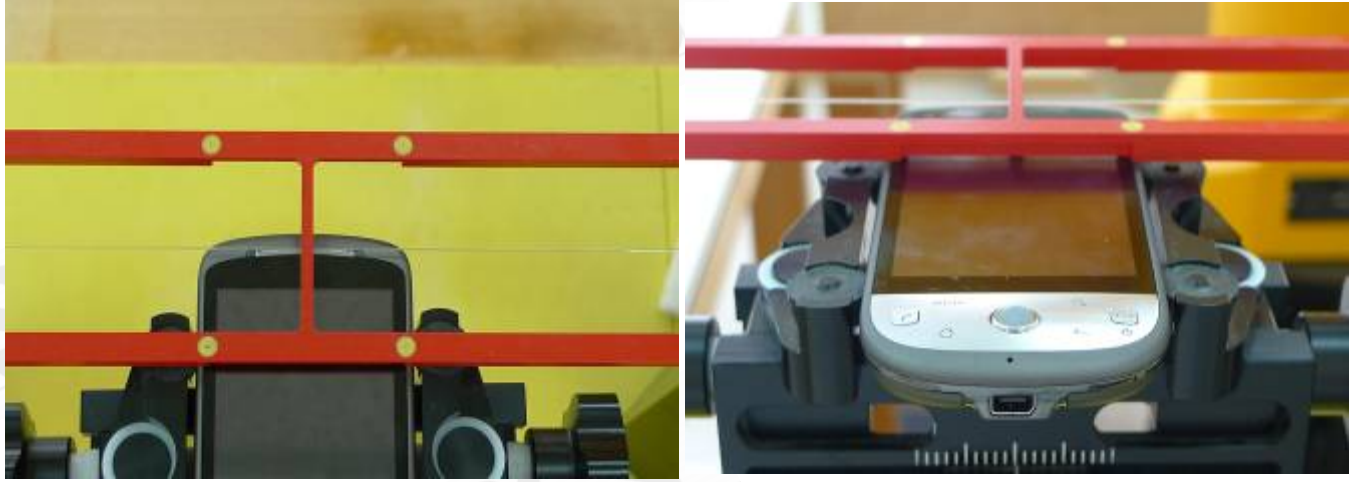
Fig.2 Receiver of mobile contact center of Arch.

Unless otherwise stated the results shown in this test report refer only to the sample(s) tested and such sample(s) are retained for 90 days only. This test report cannot be reproduced, except in full, without prior written permission of the Company. 除非另有說明,此報告結果僅對測試之樣品負責,同時此樣品僅保留90天。本報告未經本公司書面許可,不可部份複製。 This document is issued by the Company subject to its General Conditions of Service (<u>www.sqs.com/terms_e-document.htm</u>) and Terms and Conditions for Electronic Documents (<u>www.sqs.com/terms_e-document.htm</u>). Attention is drawn to the limitations of liability, indemnification and jurisdictional issues established therein. Even if printed this electronic document is original within the meaning of UCP 600 article 20b. The authenticity of this document may be verified at <u>www.sqs.son/authentication</u>. Any holder of this document is advised that information contained hereon reflects the Company's findings at the time of its intervention only and within the limits of client's instructions, if any. The Company's sole responsibility is to its Client and this document does not exonerate parties to a transaction document. parties to a transaction from exercising all their rights and obligations under the transaction documents.