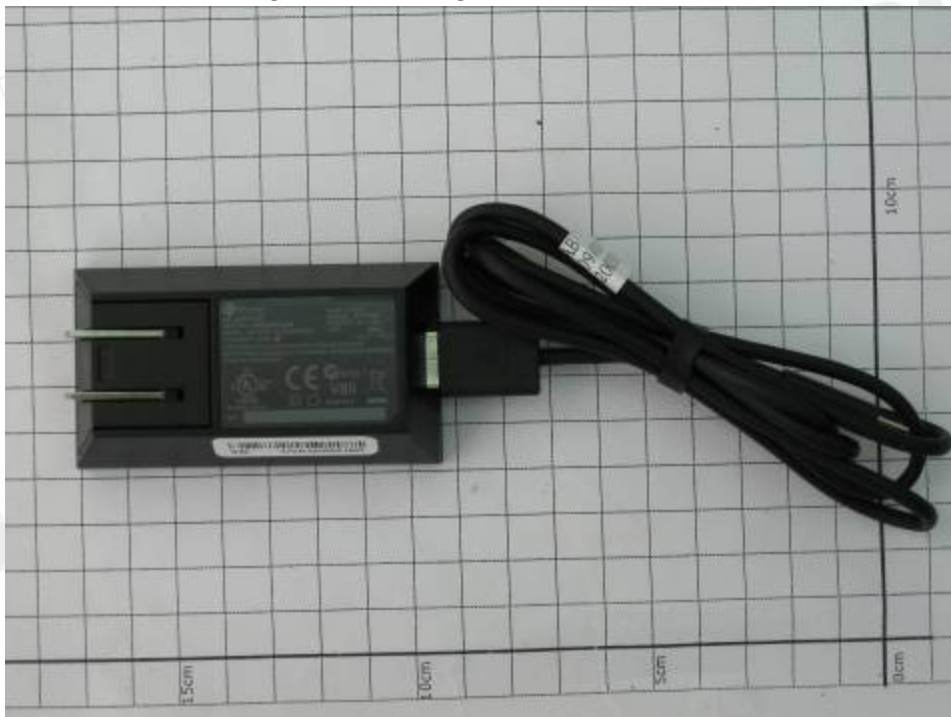
Fig.12 AC Charger(79H00078-20M)