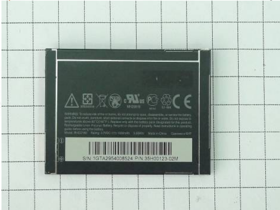
Fig.9 Front view of Battery ( Formosa)