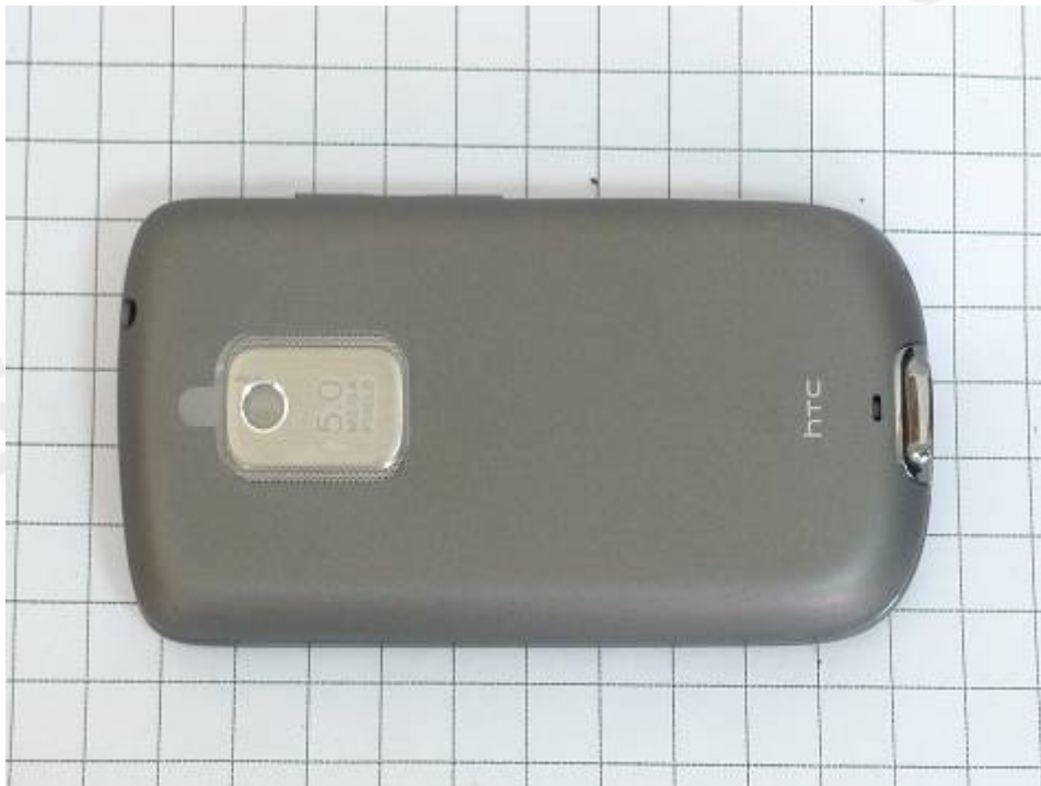
Fig.4 Back view of device

Unless otherwise stated the results shown in this test report refer only to the sample(s) tested and such sample(s) are retained for 90 days only. This test report cannot be reproduced, except in full, without prior written permission of the Company. 除非另有說明，此報告結果僅對測試之樣品負責，同時此樣品僅保留90天。本報告未經本公司書面許可，不可部份複製。