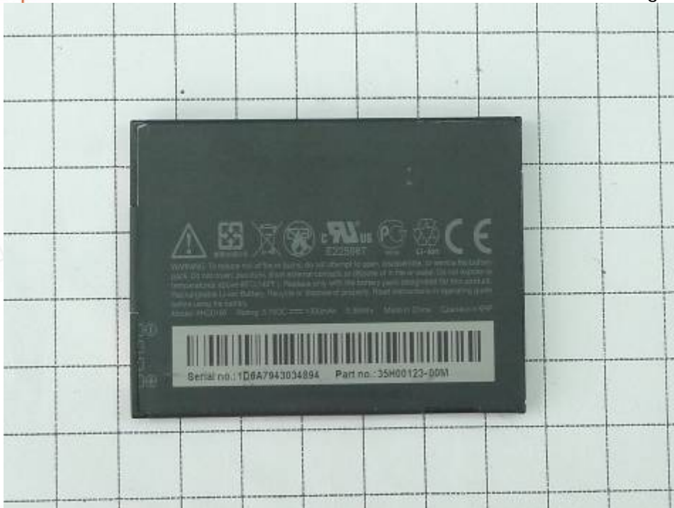
Fig.7 Front view of Battery (HT Energy)