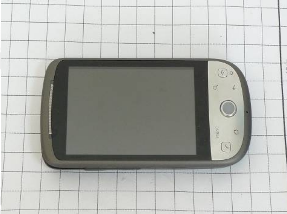
Fig.3 Front view of device