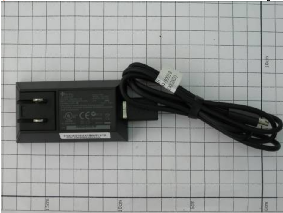
Fig.11 AC Charger(79H00082-11M)