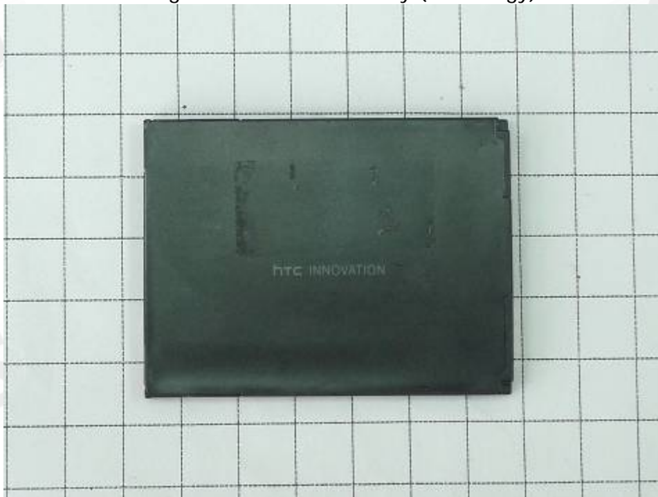
Fig.8 Back view of Battery (HT Energy)

Unless otherwise stated the results shown in this test report refer only to the sample(s) tested and such sample(s) are retained for 90 days only. This test report cannot be reproduced, except in full, without prior written permission of the Company. 除非另有說明，此報告結果僅對測試之樣品負責，同時此樣品僅保留90天。本報告未經本公司書面許可，不可部份複製。