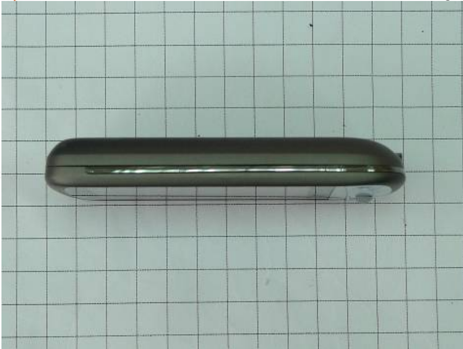
Fig.5 Right side view of device