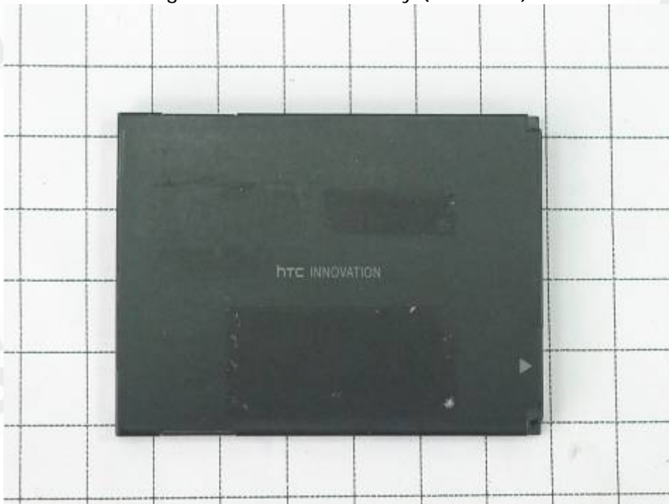
Fig.10 Back view of Battery ( Formosa)

Unless otherwise stated the results shown in this test report refer only to the sample(s) tested and such sample(s) are retained for 90 days only. This test report cannot be reproduced, except in full, without prior written permission of the Company. 除非另有說明，此報告結果僅對測試之樣品負責，同時此樣品僅保留90天。本報告未經本公司書面許可，不可部份複製。