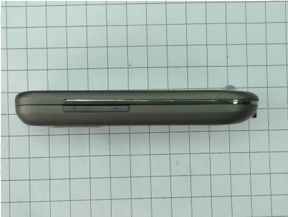
Fig.6 Left side view of device

Unless otherwise stated the results shown in this test report refer only to the sample(s) tested and such sample(s) are retained for 90 days only. This test report cannot be reproduced, except in full, without prior written permission of the Company. 除非另有說明，此報告結果僅對測試之樣品負責，同時此樣品僅保留90天。本報告未經本公司書面許可，不可部份複製。