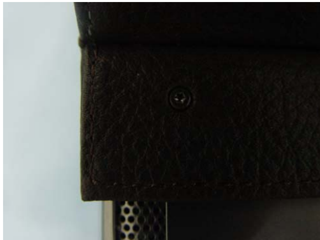
Unique star screws are used for permanent connection between EUT and holster