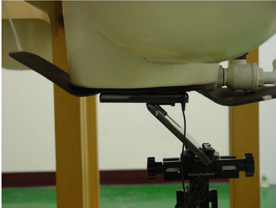
EUT Rear Face Touch in Open Mode