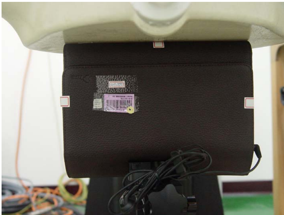
EUT Bottom Side Touch in Close Mode