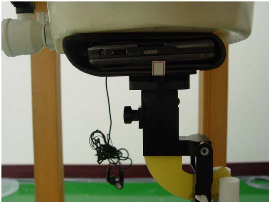
EUT Rear Face Touch in Close Mode