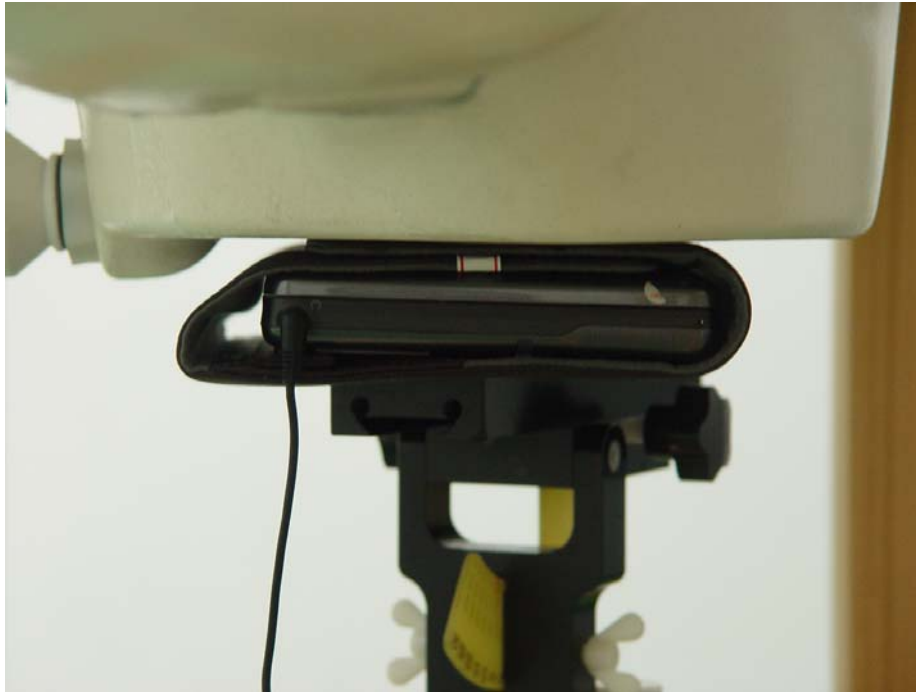
EUT Front Face Touch in Close Mode