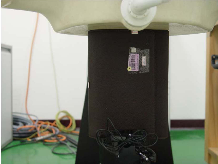
EUT Right Side Touch in Close Mode