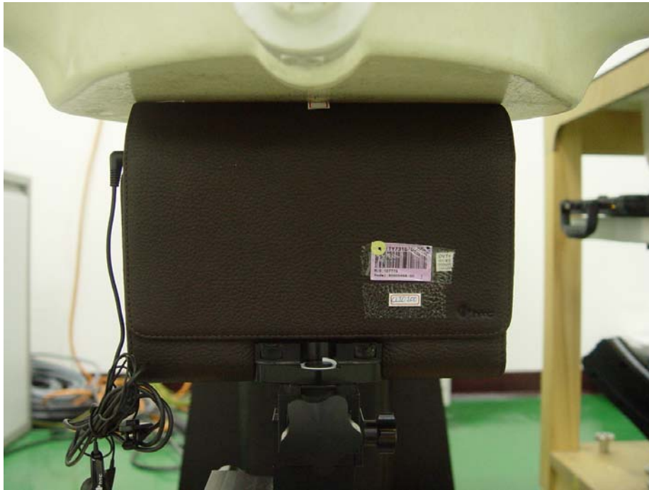
EUT Top Side Touch in Close Mode