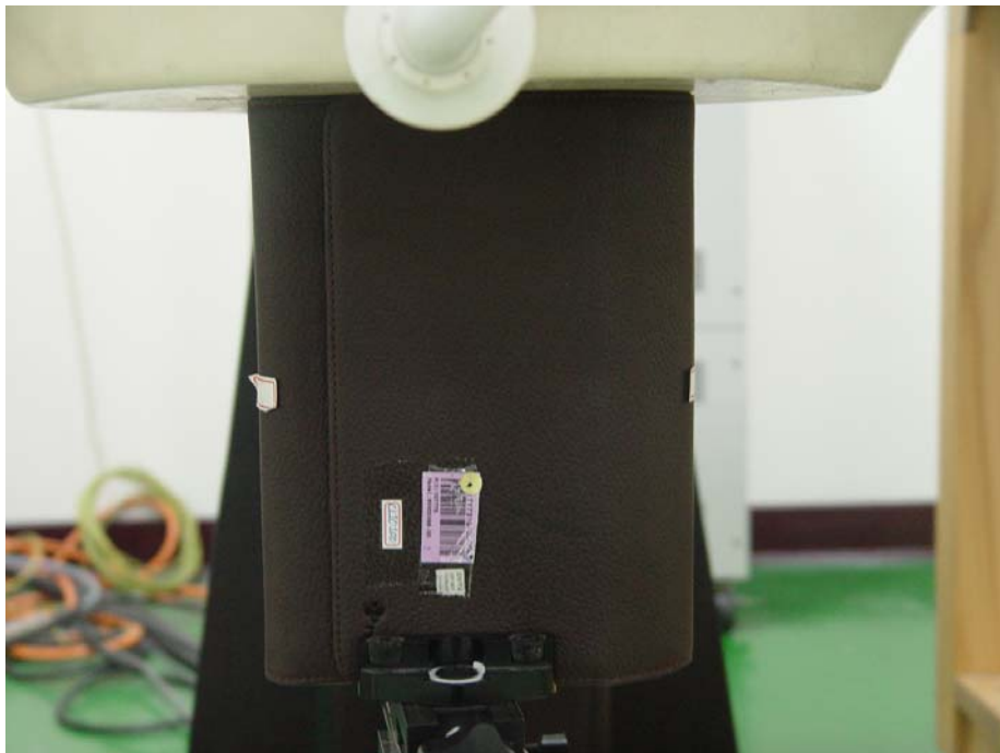
EUT Left Side Touch in Close Mode