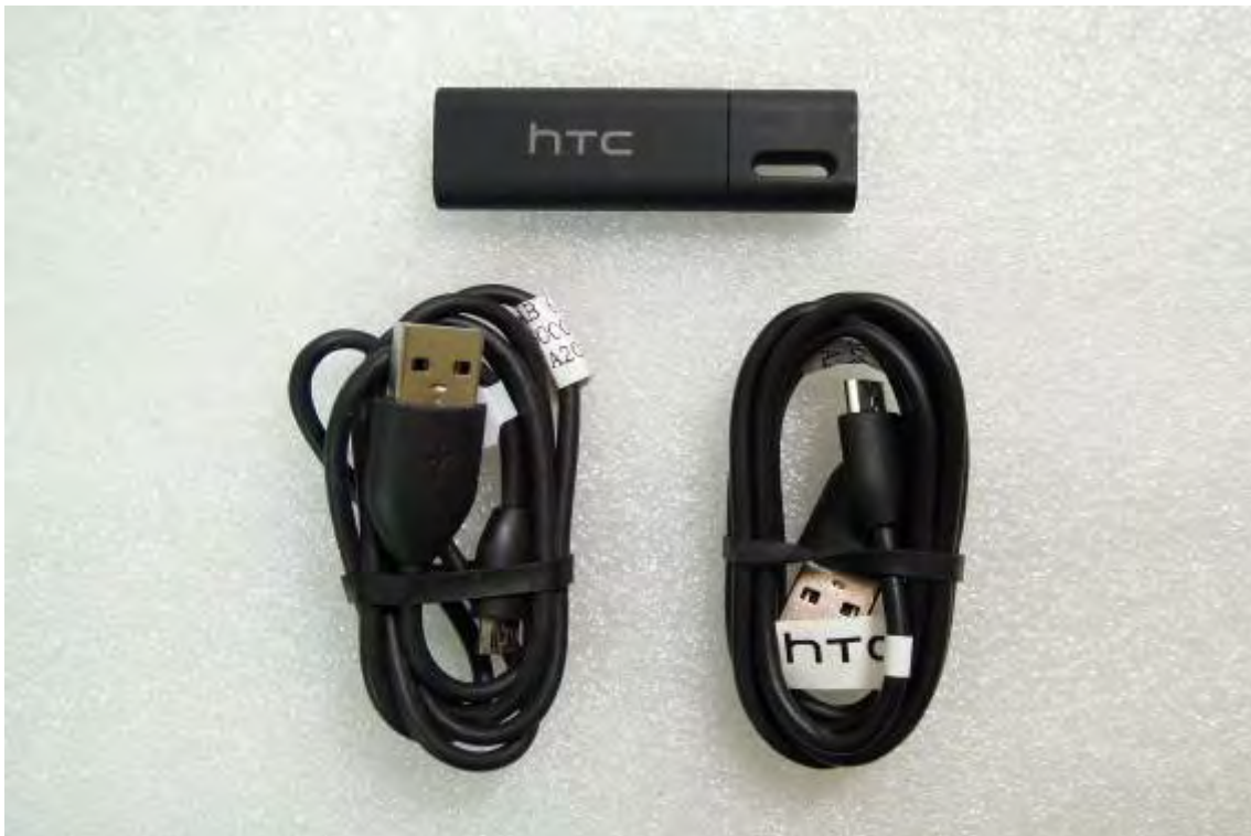
Front View of EUT - 1