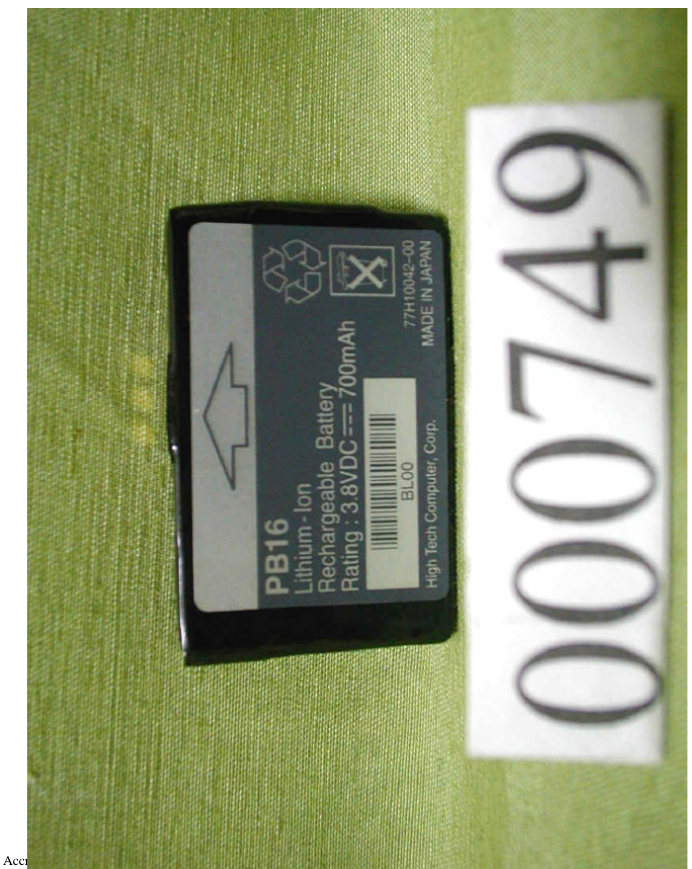
Page 54 Listed Lab. of FCC, VCC, MOC

A2LA Certificate #: 824.01 (for Emission) NEMKO Authorization #: ELA 124 (for EMC)