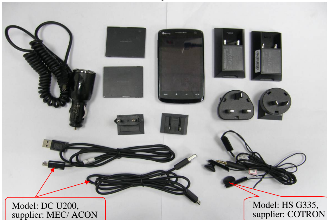
Model: DC U200, supplier: MEC/ ACON