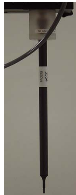
E-Field probe EX3DV4