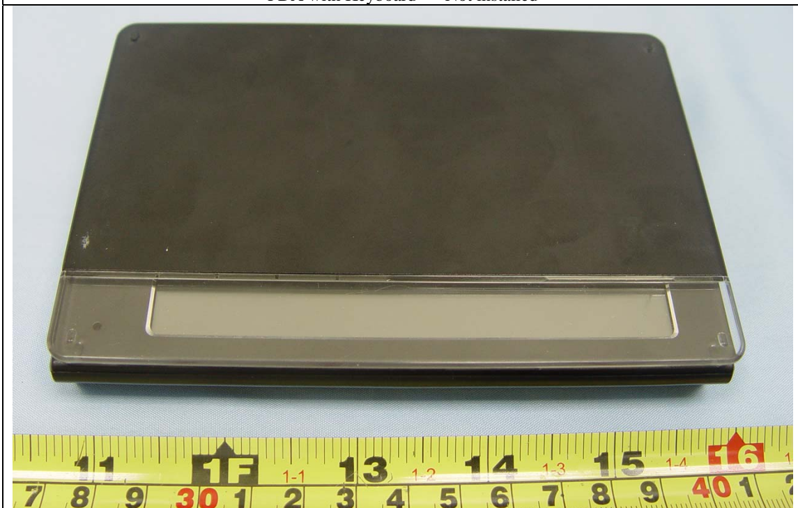
PDA with Keyboard acted as protective cover - installed