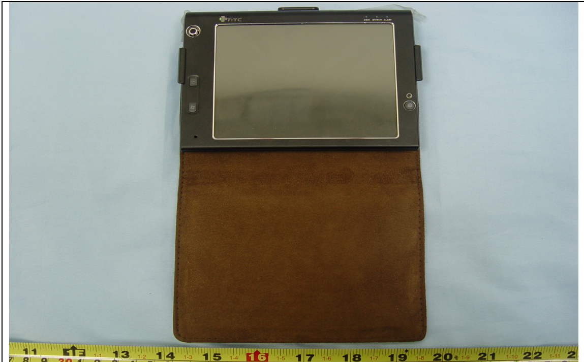
PDA with carrying case