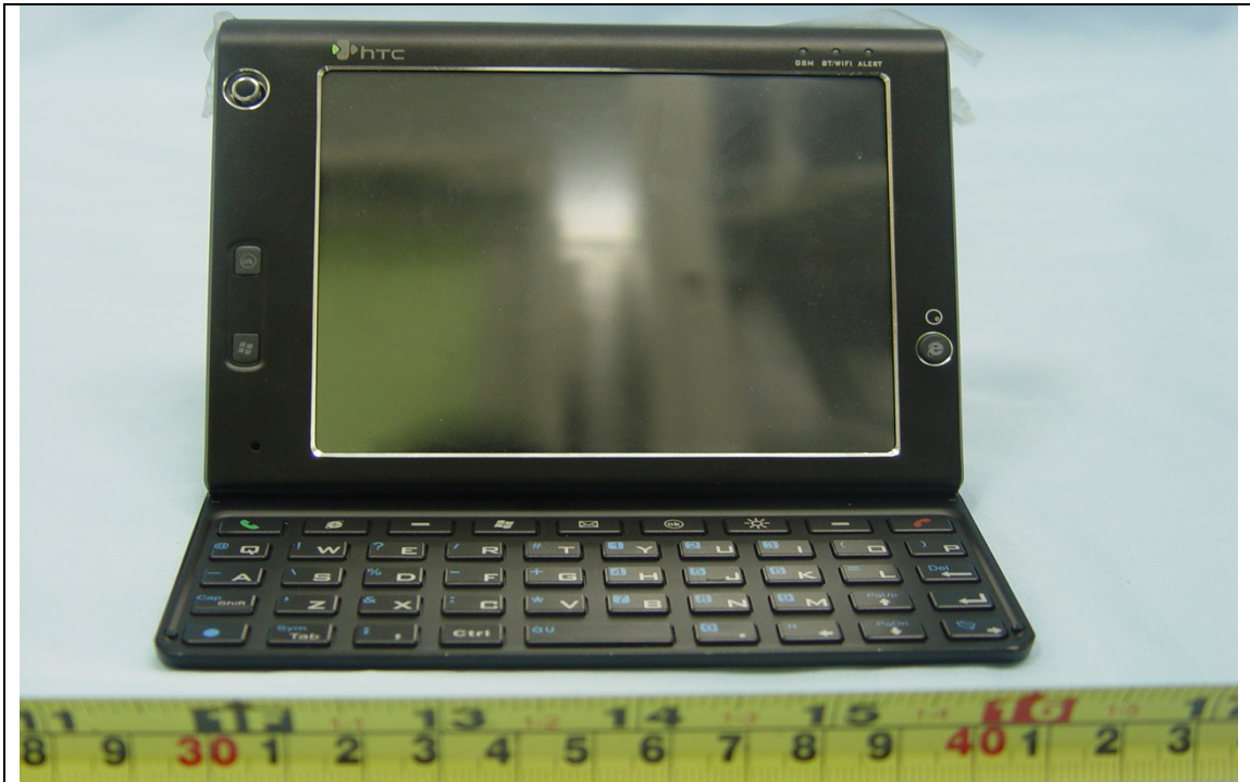
PDA with Keyboard –Front side