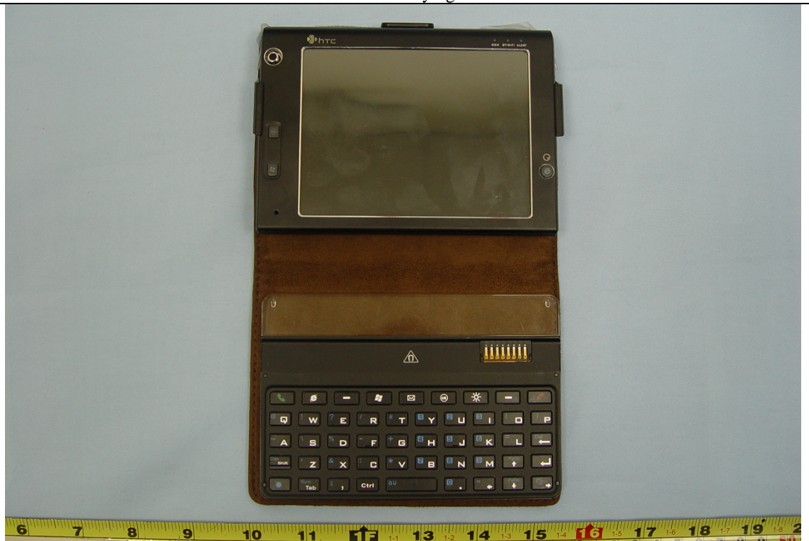
PDA with carrying case