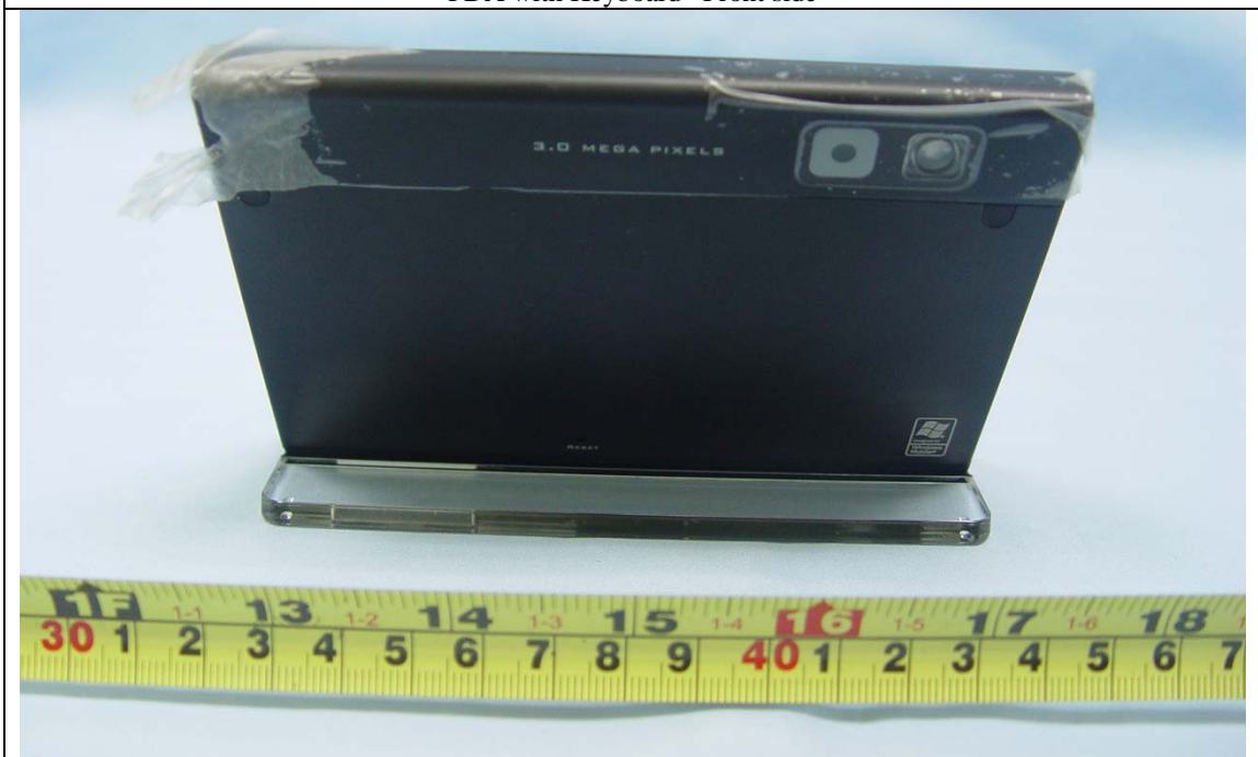
PDA with Keyboard – Rear side