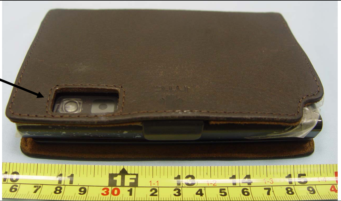
PDA with carrying case