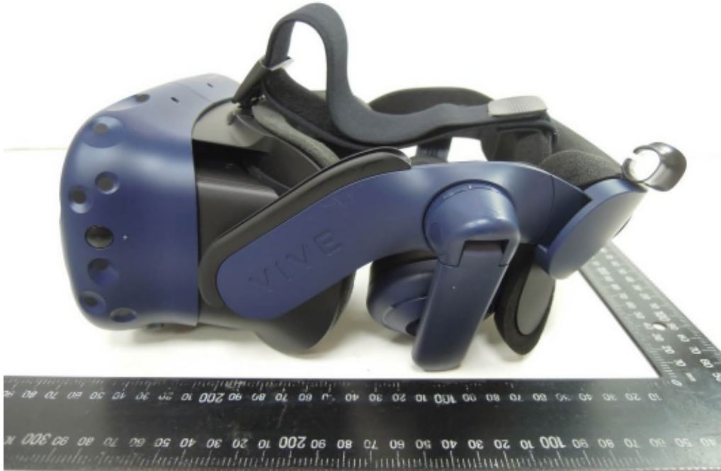
Side View of EUT – 5