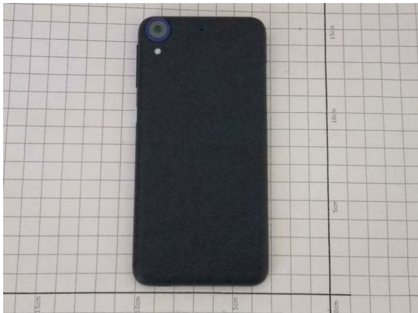
Fig. 4 Back view of EUT