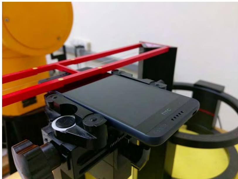
Fig. 2 Receiver of mobile contact center of Arch

Unless otherwise stated the results shown in this test report refer only to the sample(s) tested and such sample(s) are retained for 90 days only.