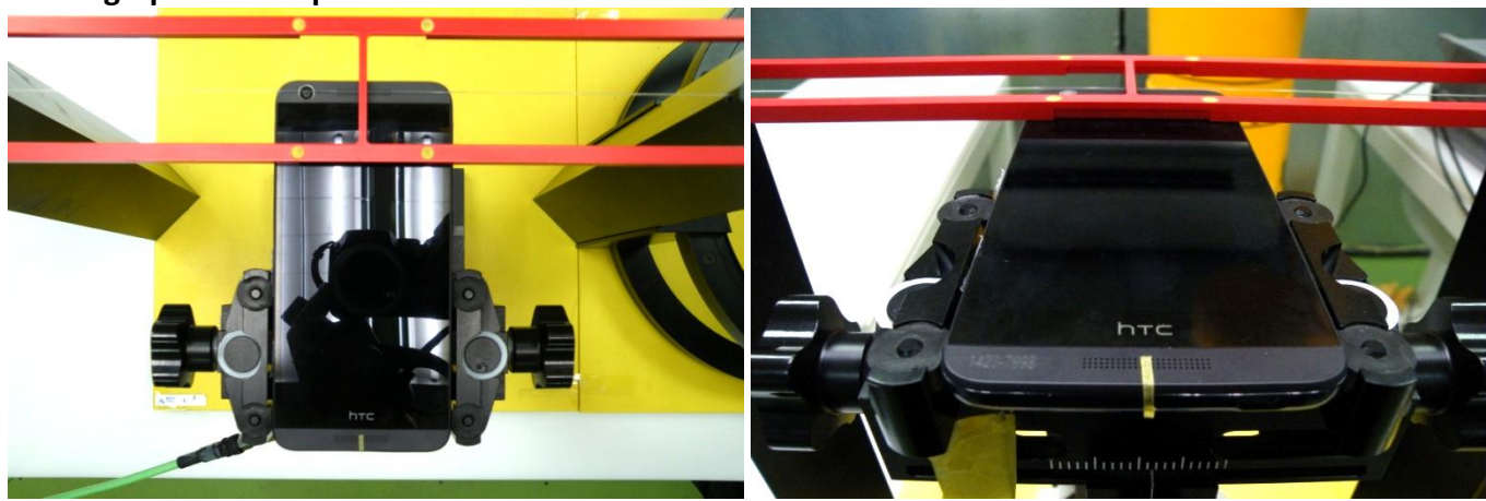
Top View Bottom View