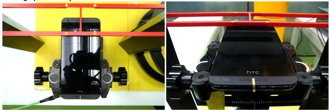
Top View Bottom View