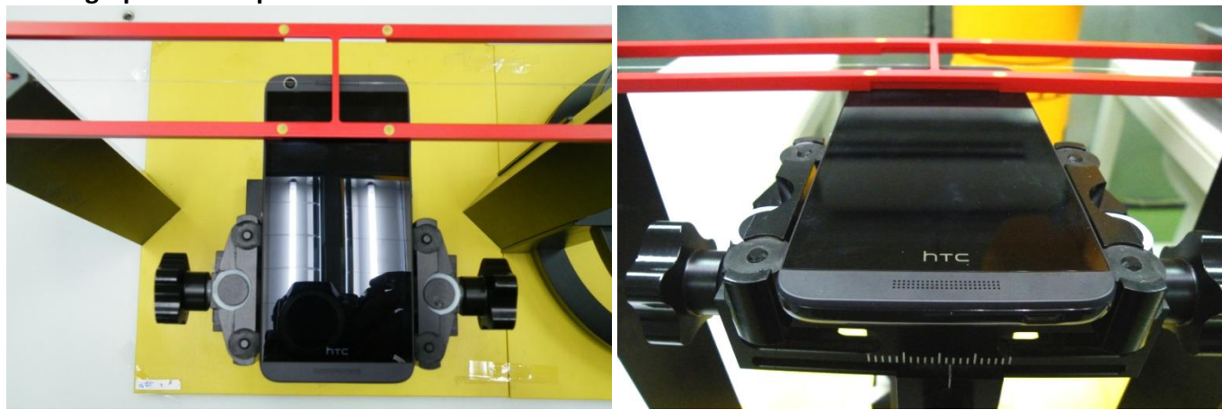
Top View Bottom View