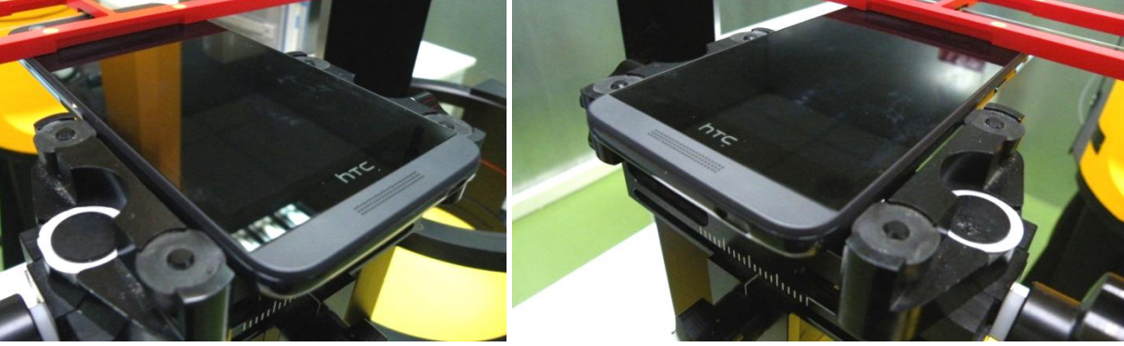
Left Side View Right Side View