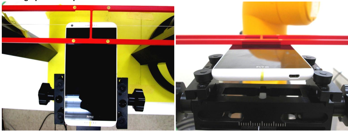
Top View Bottom View