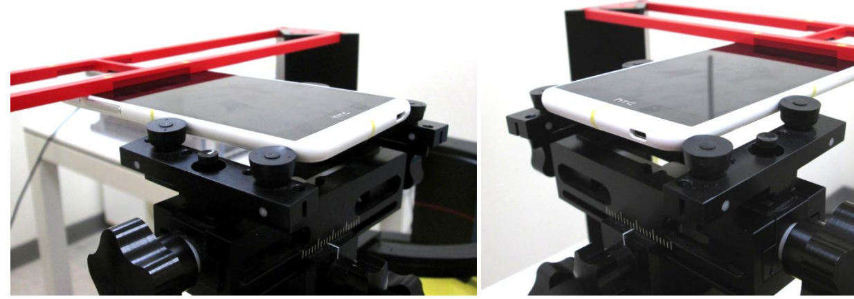
Left Side View Right Side View