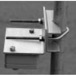
Close up of the bracket and mounting hardware attached to the amplifier.