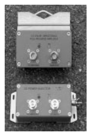
View showing the DC Injector and the pole mounted outdoor amplifier attached to its mounting bracket.

Kit Weight: Approx. 1.5 lb. with U-bolts