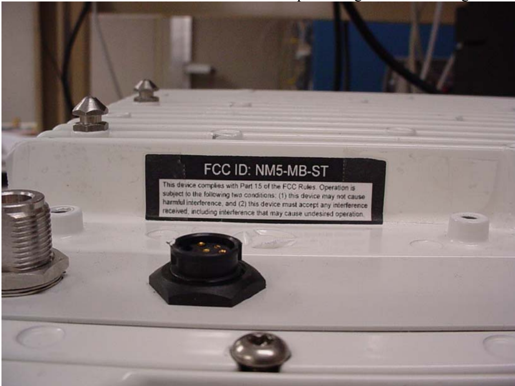
Figure 2: Label Location

The label location on the exterior of the Marquee Bridge is shown in Figure 2.