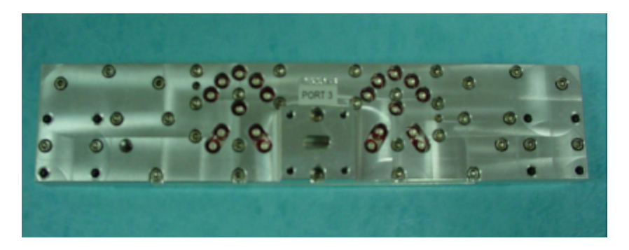
Link CX 24GHz duplexer, top view