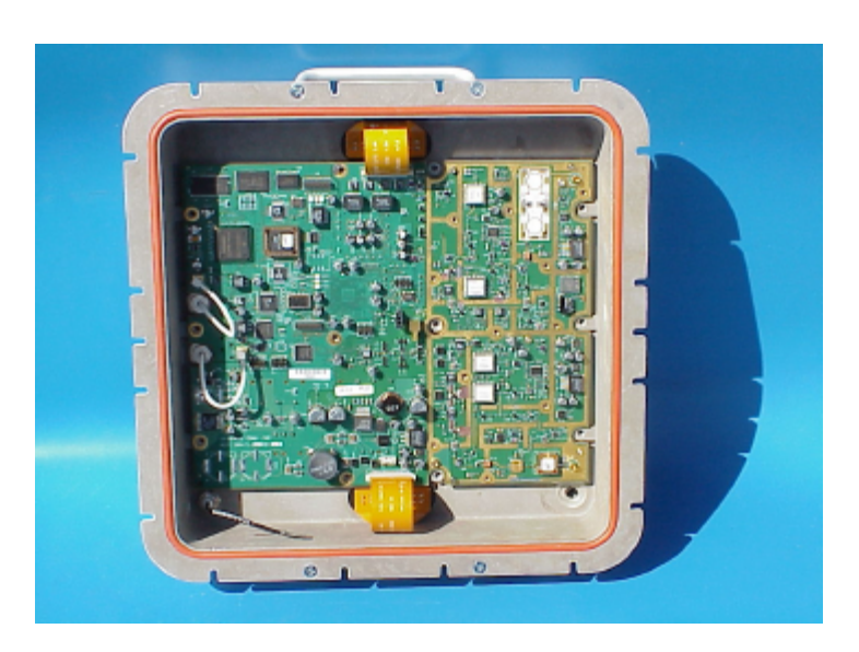
Link CX 24GHz view of PCB in enclosure without RF shield