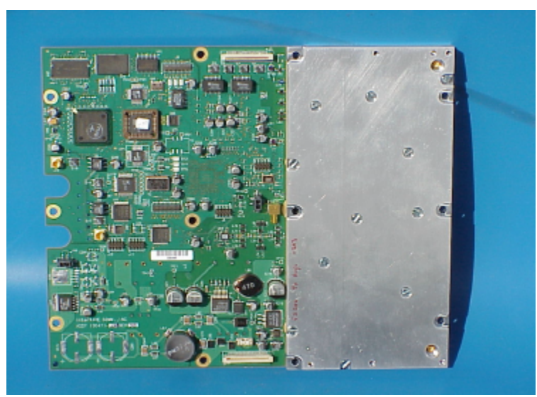
Link CX 24GHz top view of PCB with shields in place