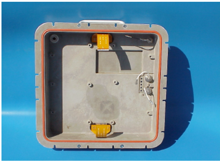
Link CX 24GHz view of enclosure bottom