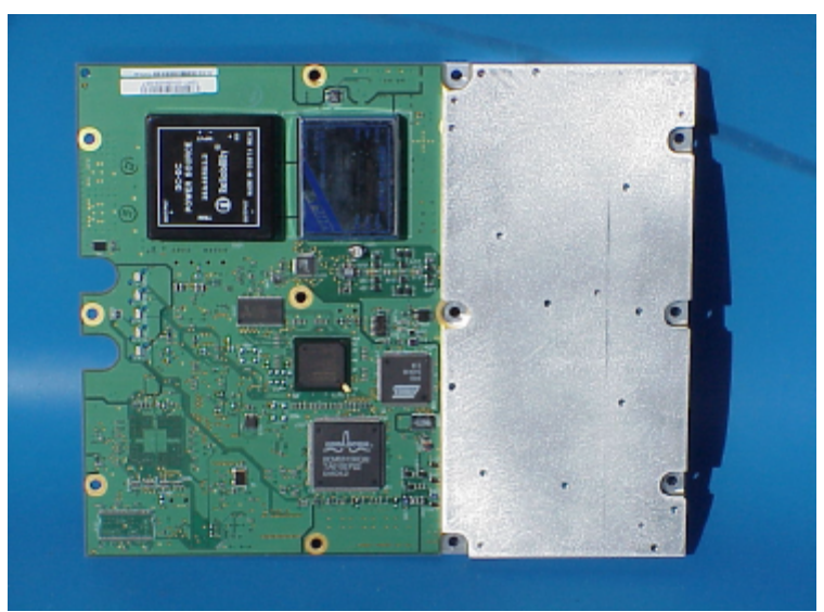
Link CX 24GHz bottom view of main PCB with shields in place