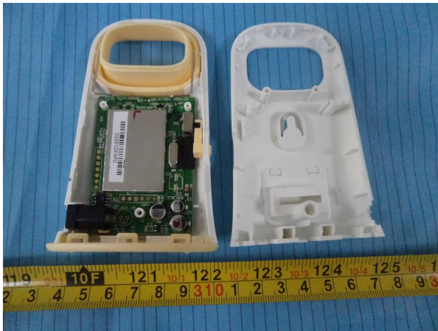
EUT – Main Board Components View