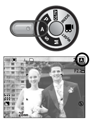
[ Aperture priority mode ]