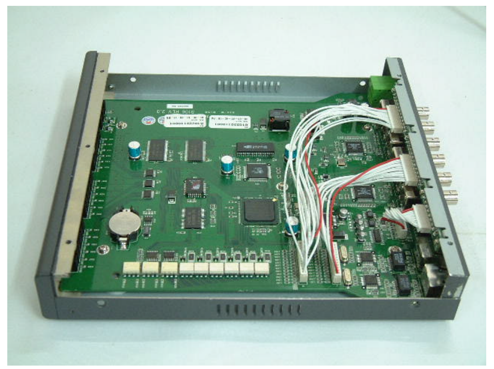
<INTERNAL VIEW OF E.U.T>