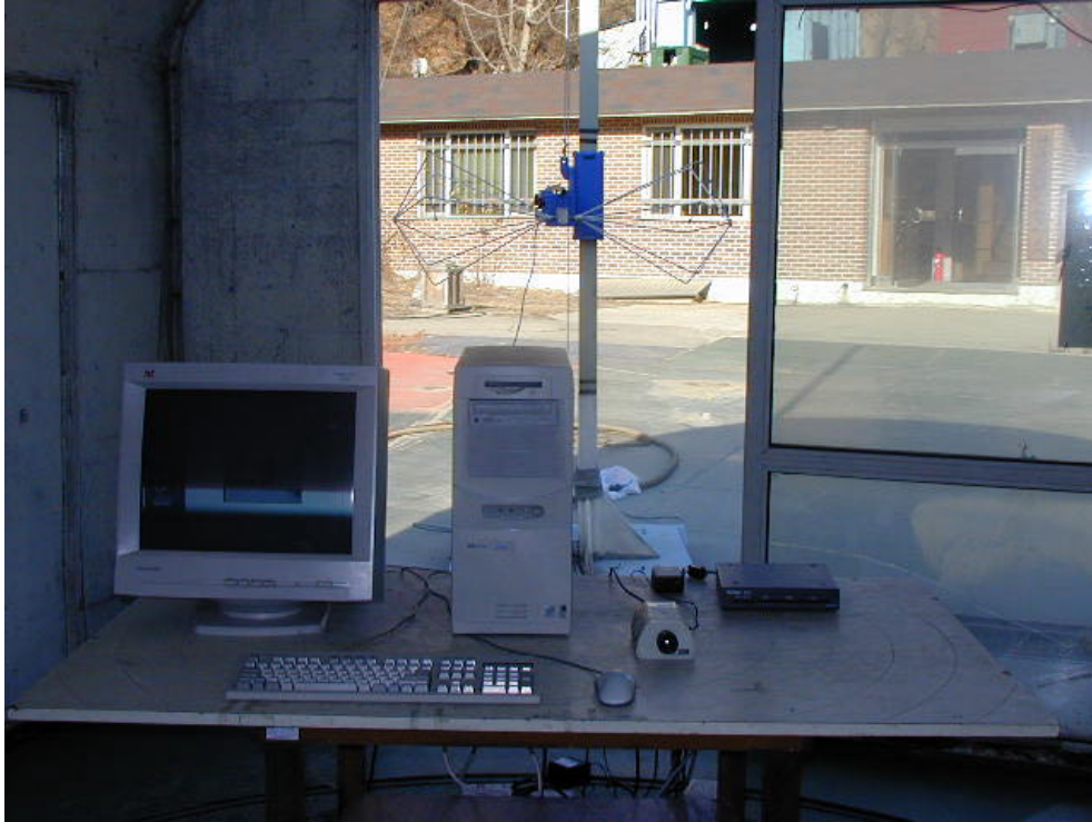
RADIATED EMISSION SETUP PHOTOGRAPH - FRONT VIEW ( 30 - 300 MHz )