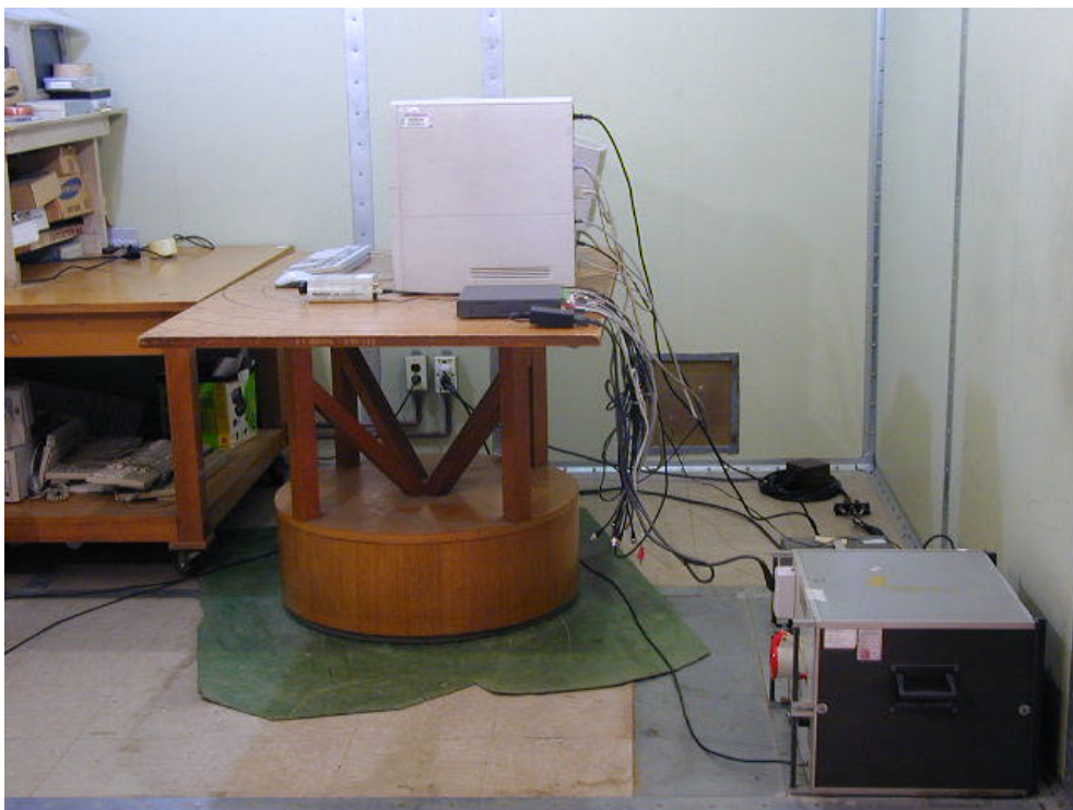
LINE CONDUCTED SETUP PHOTOGRAPH - REAR VIEW