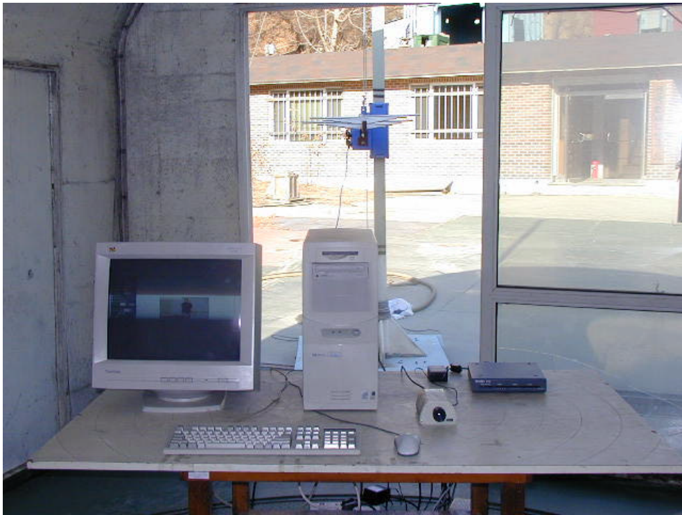
RADIATED EMISSION SETUP PHOTOGRAPH - FRONT VIEW ( 300- 1000 MHz )