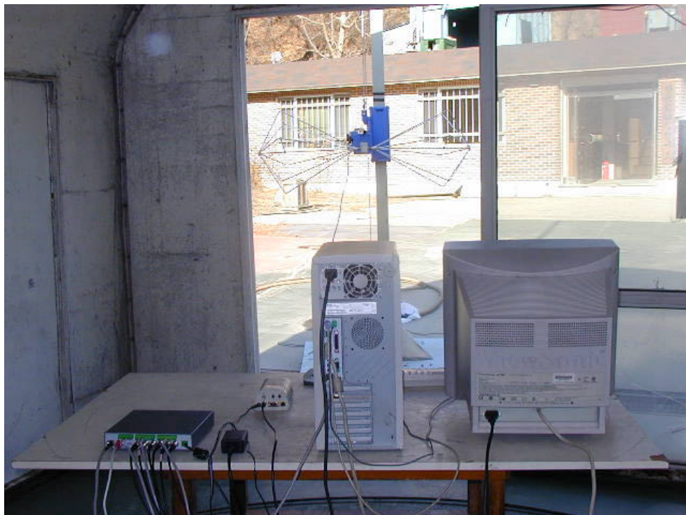
RADIATED EMISSION SETUP PHOTOGRAPH - REAR VIEW ( 30 - 300 MHz )