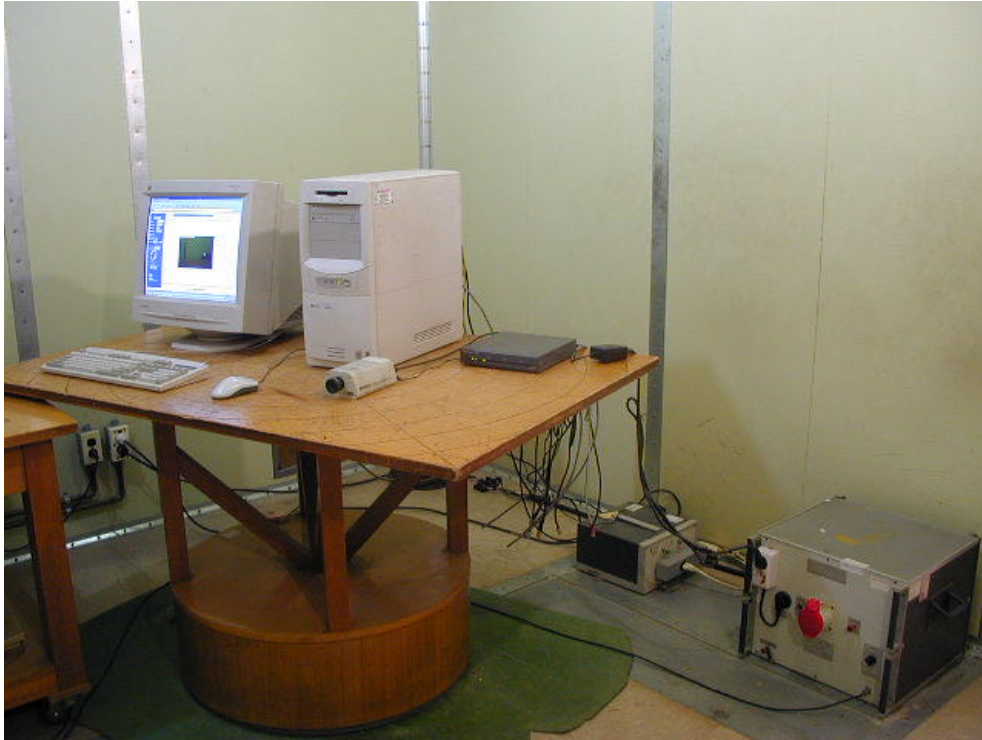
LINE CONDUCTED SETUP PHOTOGRAPH - FRONT VIEW