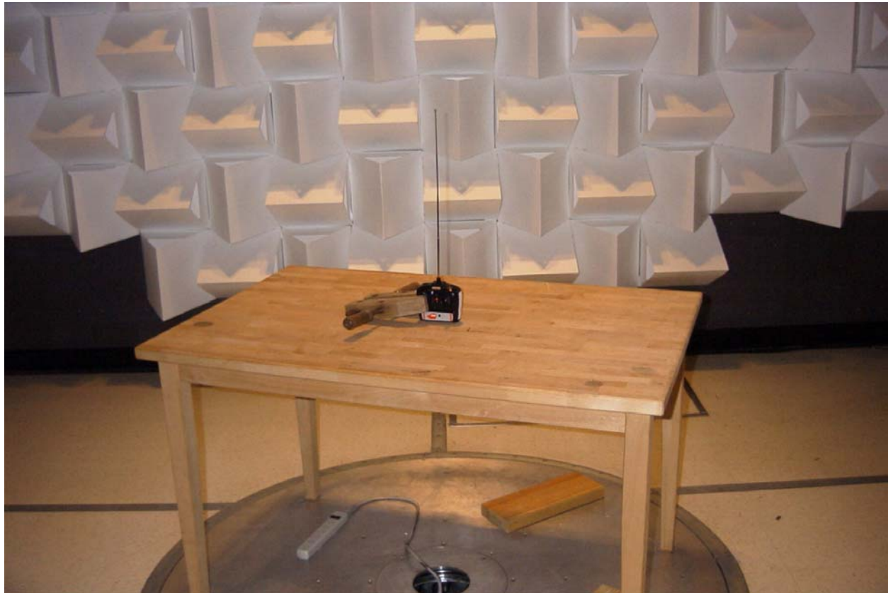
TEST SET UP PHOTO

APPLICANT: DICKIE-SPIELZEUG GmbH & CO KG