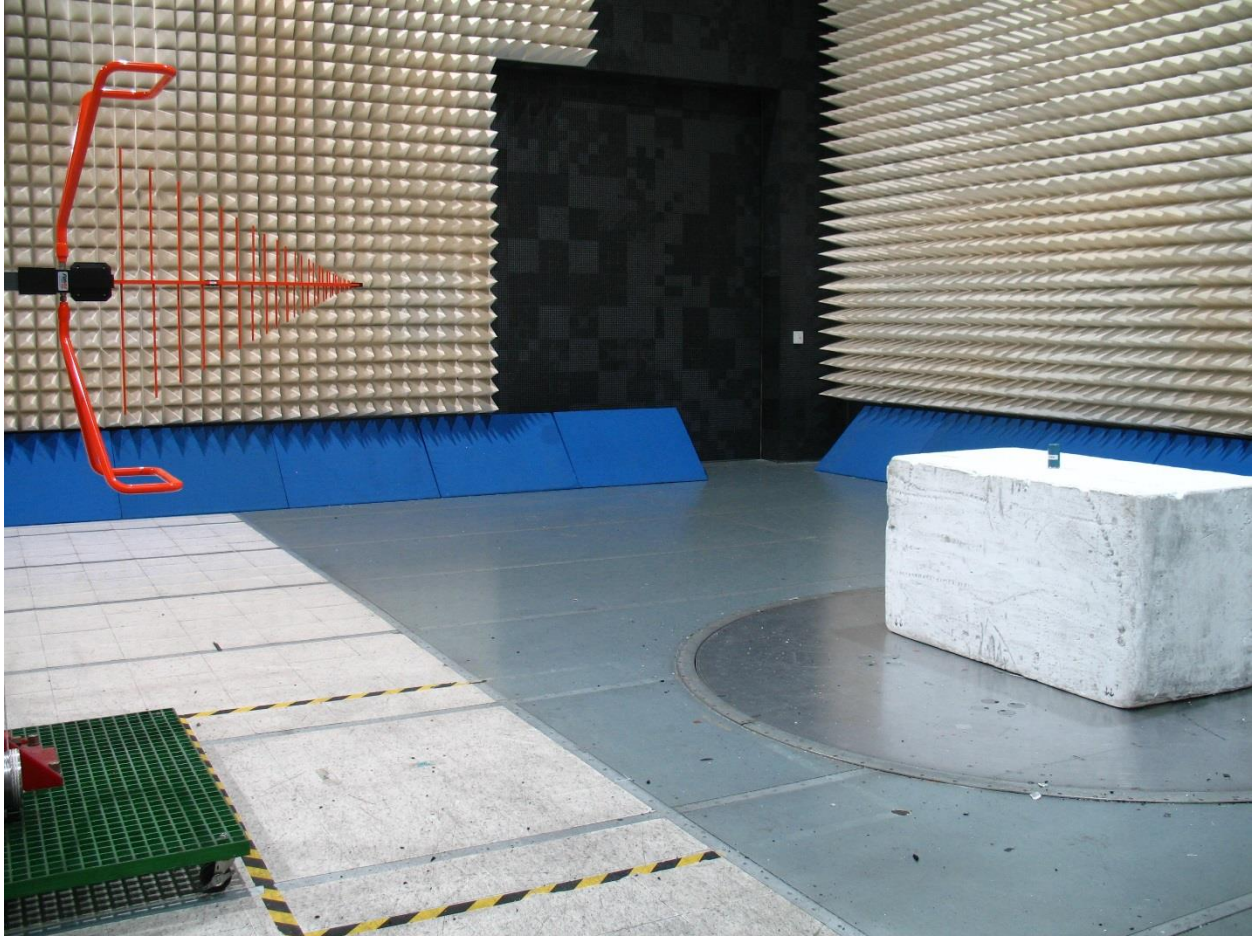
Radiated Measurements (below 1GHz)