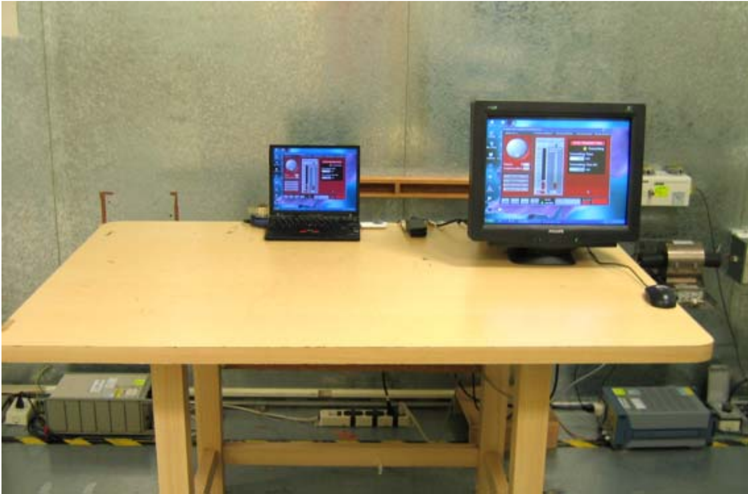
The Front View of Highest Conducted Set-up For EUT